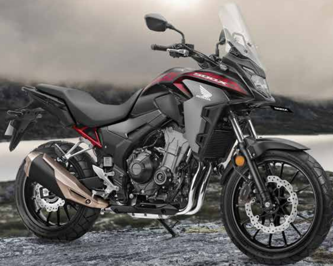
Matt Gunpowder Black Metallic