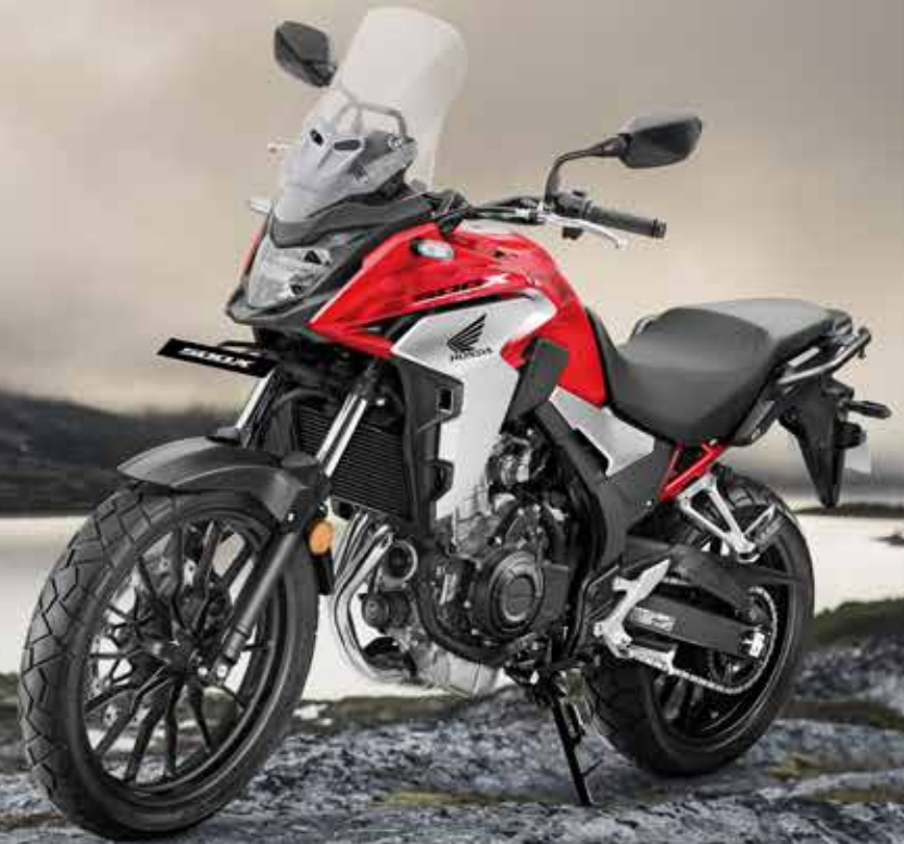
Grand Prix Red