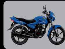
Vibrant Blue Metallic