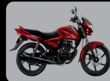
Rebel Red Metallic