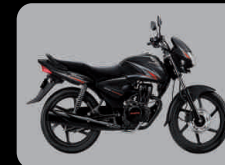
Black with Red Stripes