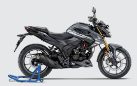
MATTE AXIS GRAY METALLIC