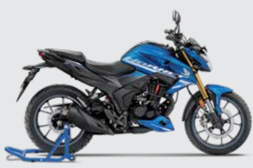
MATTE MARVEL BLUE METALLIC