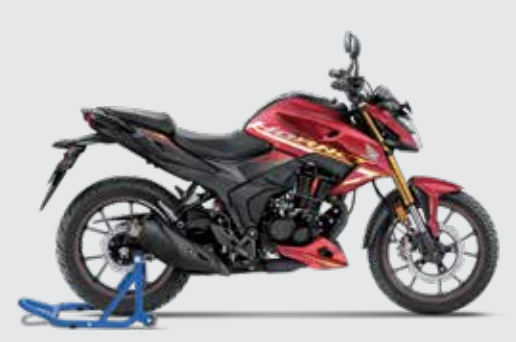
MATTE SANGRIA RED METALLIC