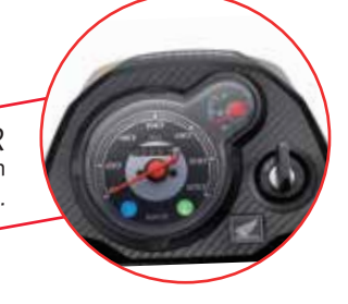
STYLISH SPEEDOMETER Stylish instrument panel comes equipped with a fuel gauge for your fun ride.