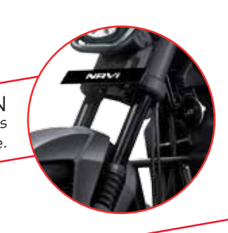
FRONT TELESCOPIC SUSPENSION Front telescopic suspension ensures that no bumps interrupt your fun ride.