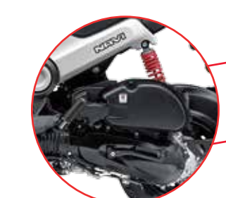
Honda ENGINE Rev around town and have fun with a110cc Honda Engine.