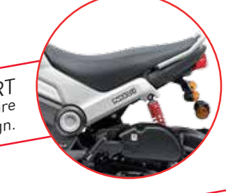
RIDING COMFORT RIDING COMFORT Have fun with a comfortable riding posture riding posture thanks to the superior design.