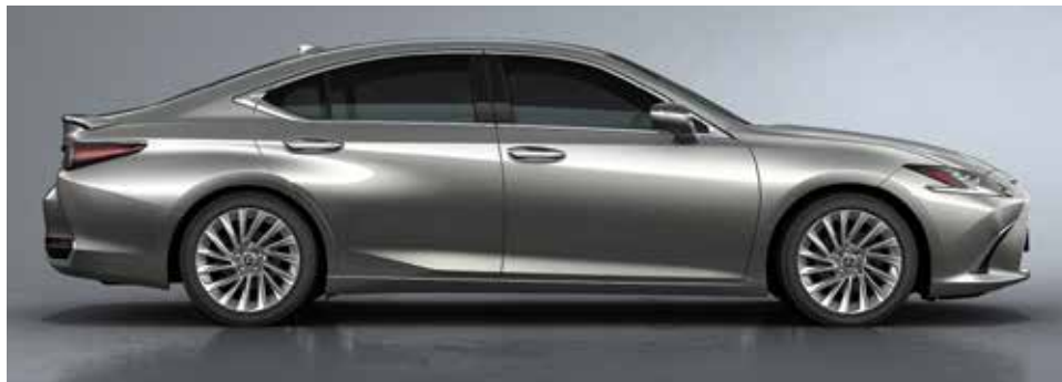
Sonic Titanium <1J7>