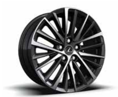
45.72 cm (18-inch) Aluminum wheels