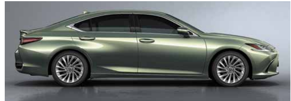
Sunlight Green <6X0>