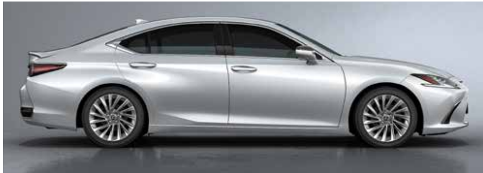
Sonic Quartz <085>

The ES is available in a selection of captivating and stimulating exterior and interior colors. Its rich form shows a changing face to the world in different light conditions such as sunlight and streetlights at night, providing a dramatic view that changes with the location and time of day.