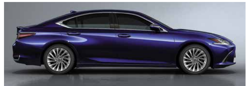
Deep Blue Mica <8X5>