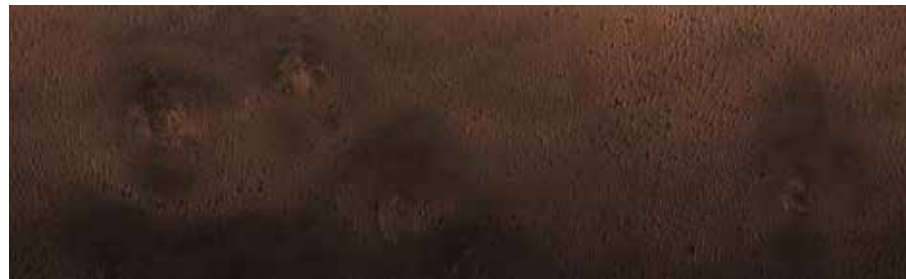
Walnut (Open Finish/Brown)