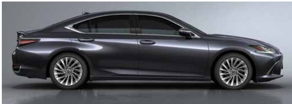
Sonic Chrome <1L1>