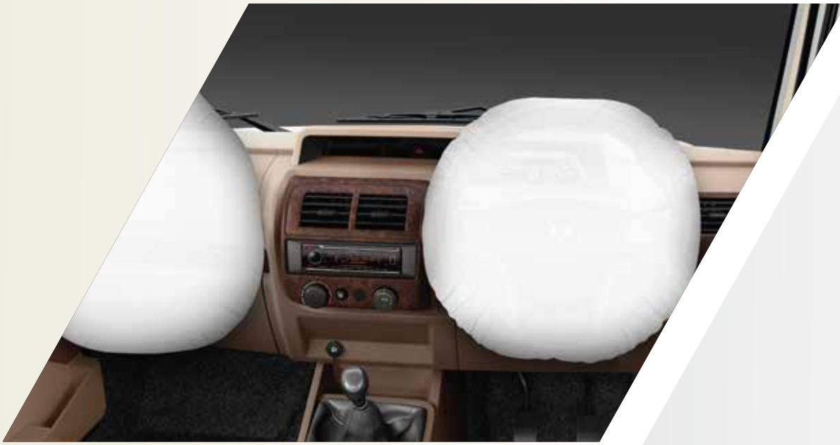
Dual Airbag for additional safety