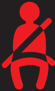
Driver + co-driver seat belt reminder