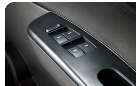
POWER WINDOWS ON ALL DOORS*