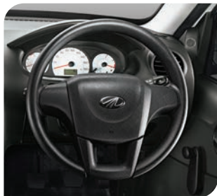
TILTABLE POWER STEERING