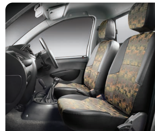
HUGE CABIN SPACE