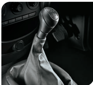
5 GEAR TRANSMISSION