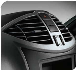
AIR CONDITIONER WITH 4-STEP BLOWER