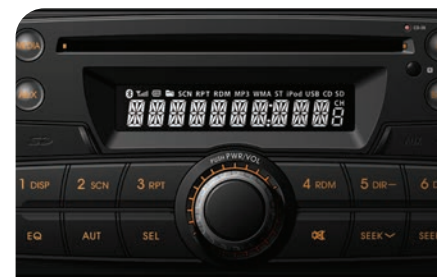
2 DIN MUSIC SYSTEM*