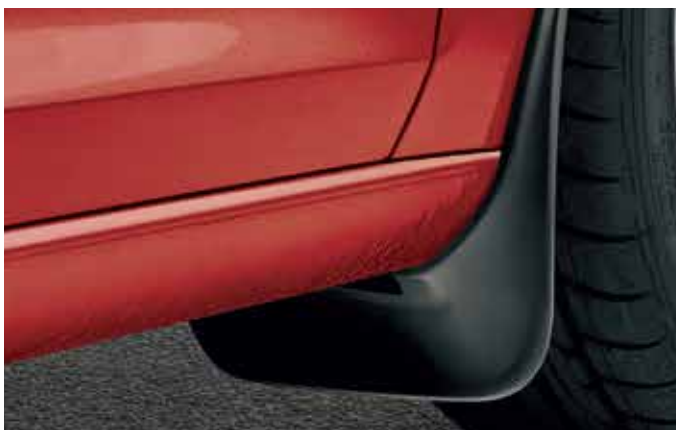
MUD FLAP, SET OF 4 PCS (FRONT AND REAR)