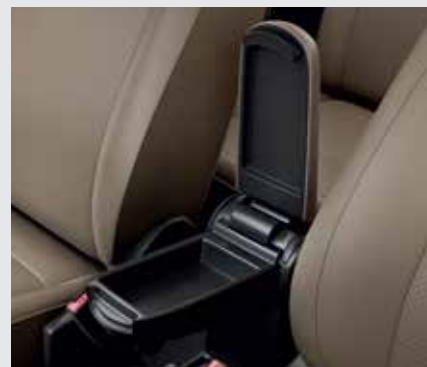
Storage compartment in the front centre console, under the front centre armrest