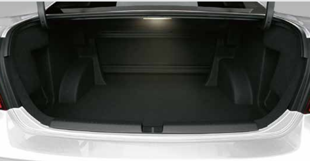
460 litres of illuminated luggage compartment space

A good relationship is one where you get enough space to yourself. And the new ŠKODA RAPID is the perfect partner which is thoughtfully designed to accommodate you and everything you might ever need.