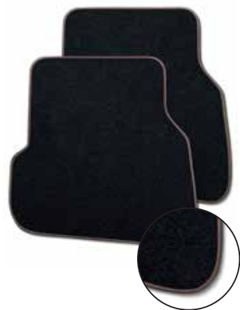
SPORTY RED STITCHING BLACK TEXTILE MATS