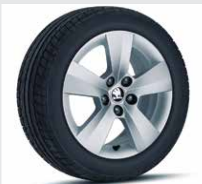
Matone, R15 Available in Ambition variant