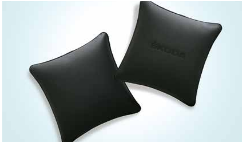
PERFORATED BLACK CUSHIONS, SET OF 2 PCS