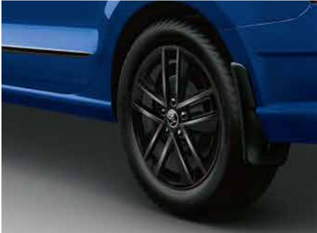
MUD FLAP, SET OF 4 PCS (FRONT & REAR)