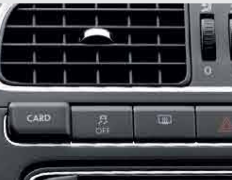
SmartClip card holder