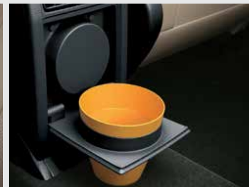
Cup holders, front and rear