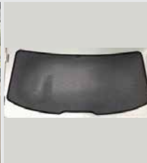
Rear Windscreen Sunblind