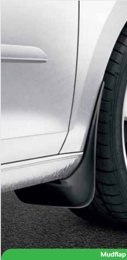
Mudflap (FR/RR Set)