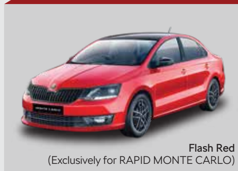
Flash Red (Exclusively for RAPID MONTE CARLO)