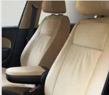
Leatherette Seat Cover