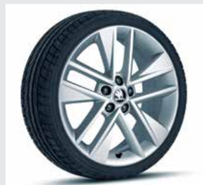
Clubber, R16 Available in Style variant