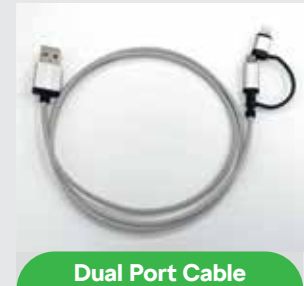
Dual Port Cable