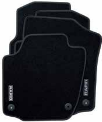
TEXTILE MATS WITH BLACK STITCHING