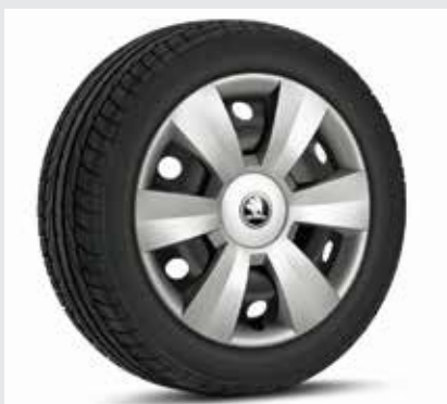
Dentro, R15 Available in Active variant