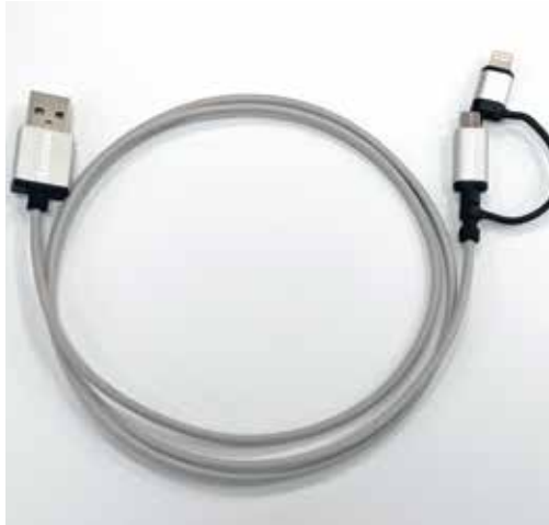
DUAL PORT CABLE