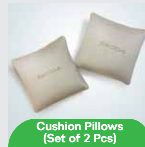
Cushion Pillows (Set of 2 Pcs)