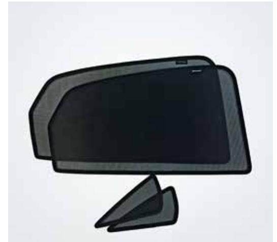
SUNBLINDS, SET OF 4 PCS