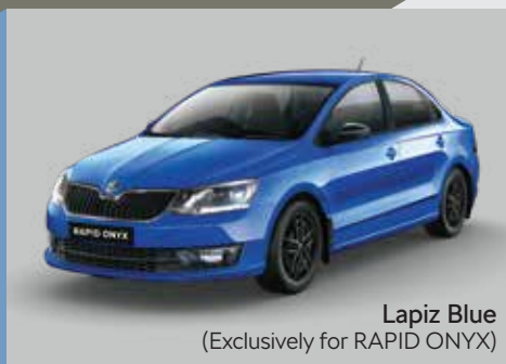
Lapiz Blue (Exclusively for RAPID ONYX)