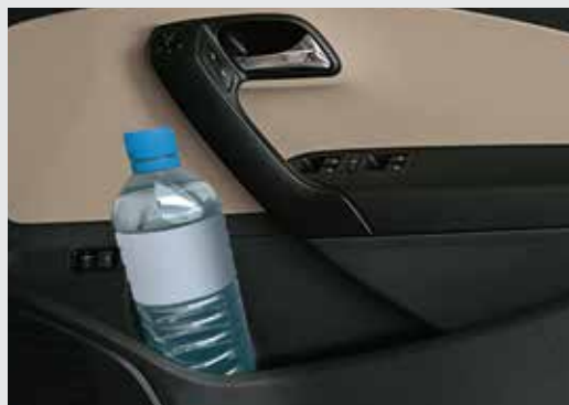
Bottle holders in doors