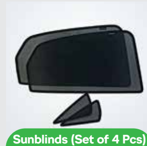
Sunblinds (Set of 4 Pcs)