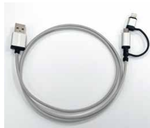
DUAL PORT CABLE