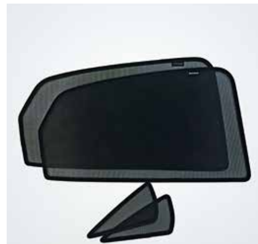
SUNBLINDS, SET OF 4 PCS