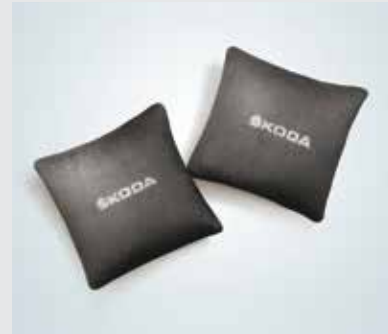
Cushion Pillows (set of 2 Pcs)