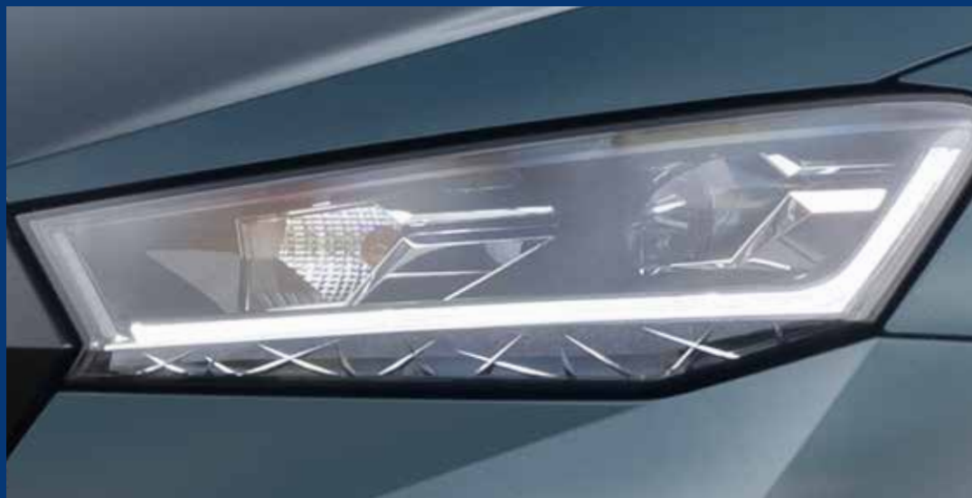
»» LED Headlamps with DRLs