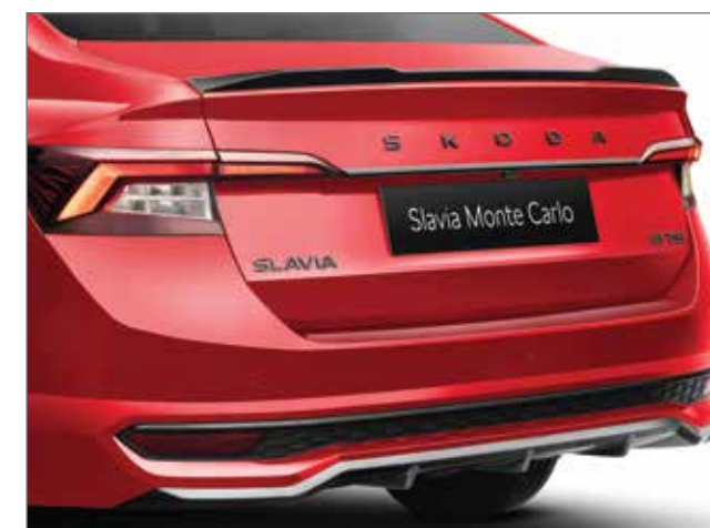
»» Sporty Black Exterior Package