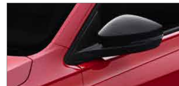
» Glossy Black ORVMs