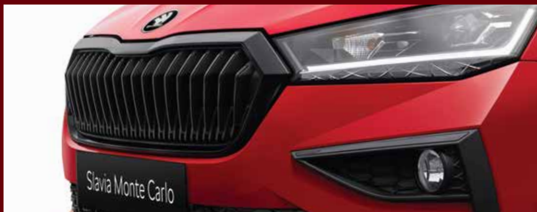
»» Black Škoda Signature Grill