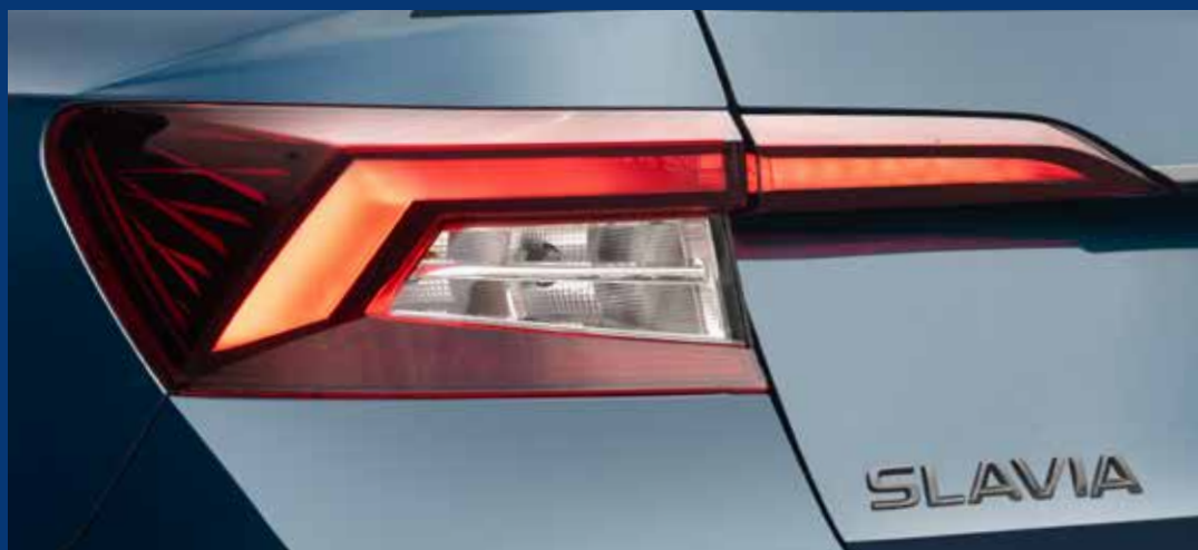
»» Darkened Tail Lamps