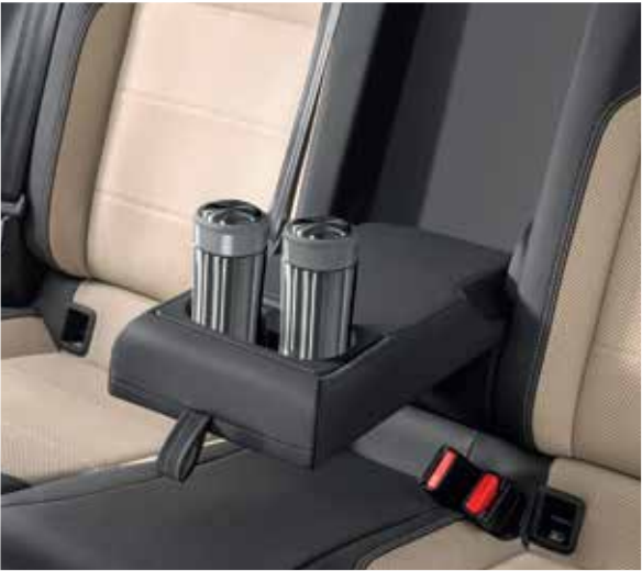
Cupholders In The Armrest