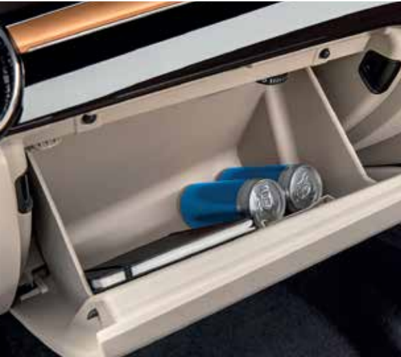
Cooled Glove Box