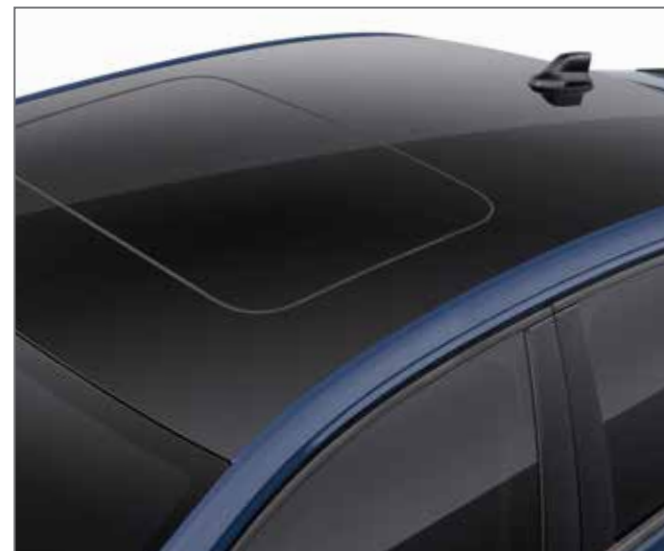
»» Dual Tone Roof with Electric Sunroof