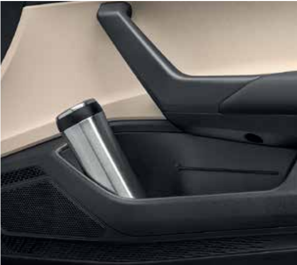
Storage In Front And Rear Doors