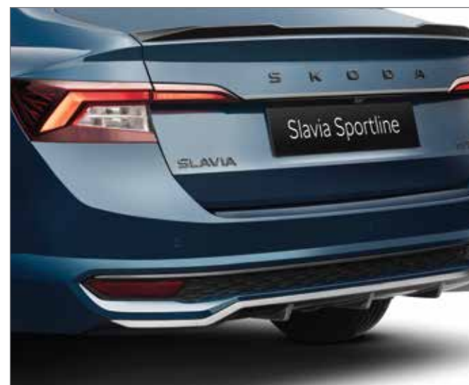
»» Sporty Black Exterior Package