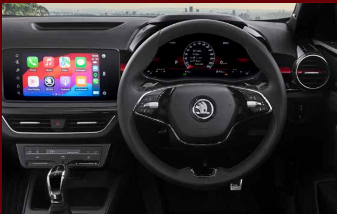
»» 20.32cm Škoda Virtual Cockpit with Red Theme