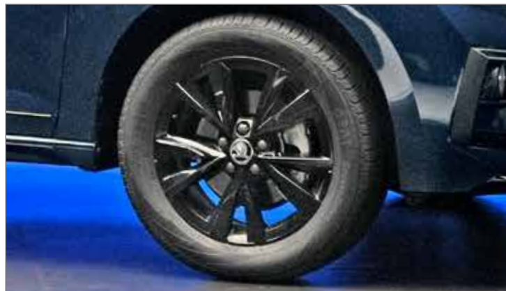
» R16 Black Alloy Wheels