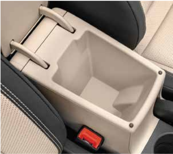
Storage In Front Centre Armrest