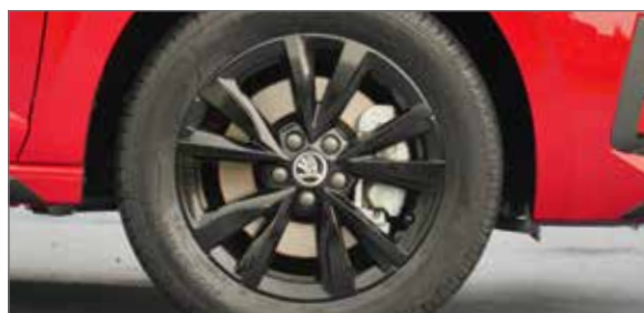
» R16 Black Alloy Wheels