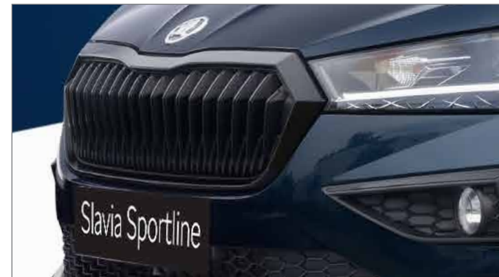
» Black Škoda Signature Grill