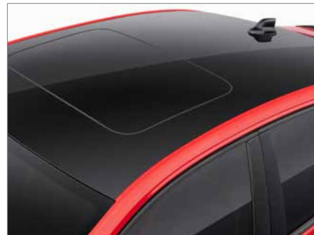
»» Dual Tone Electric Sunroof