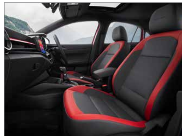
»» Monte Carlo Inscribed Ventilated Front Leatherette Seats