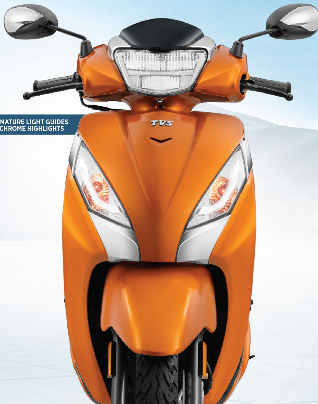
SIGNATURE LIGHT GUIDES + CHROME HIGHLIGHTS