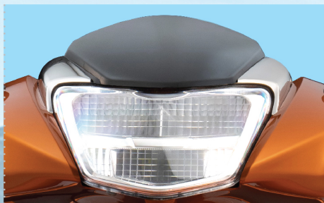
STYLISH LED HEADLAMP WITH VISOR