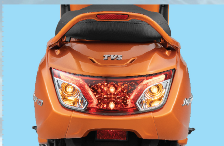
ELEGANT TAIL LAMP WITH REFLECTOR