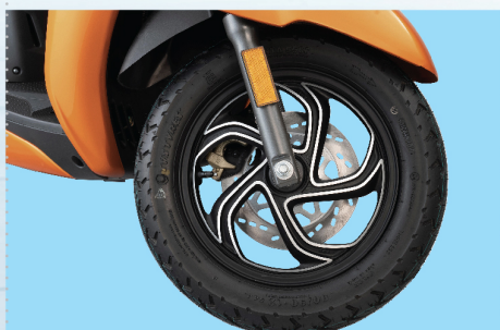
DIAMOND CUT ALLOY WHEELS