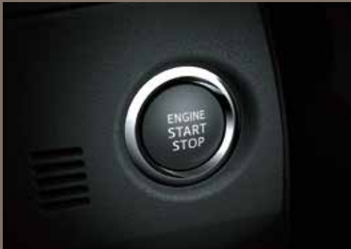
Smart Entry with Push Start Button