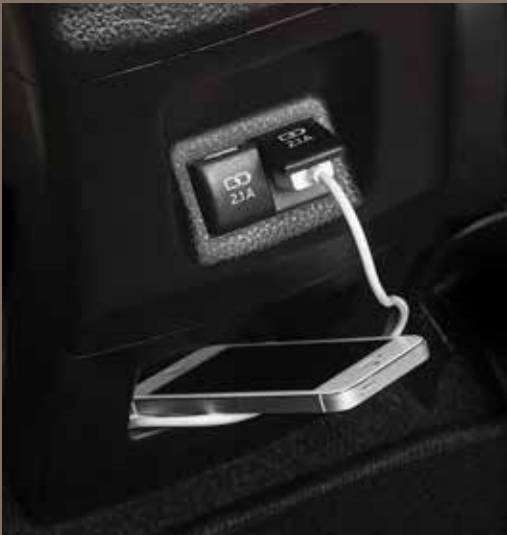
Dual Rear Power Socket

Smartly tilts the ORVM while reversing to give the driver a perfect view and retracts automatically when the car is locked