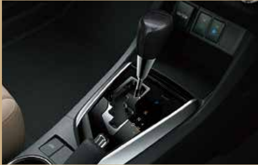
7-Speed Sequential CVT-i with Sport Mode & Paddle Shift