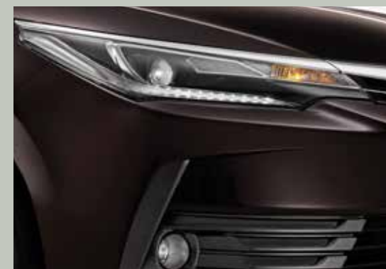
Sleek Bi-beam LED Headlamps with Auto Function

With a refreshed futuristic front creating sharp character lines, the vehicle exudes prestige. The wide upper grille along with the sleek Bi-beam LED Headlamps give the car an advanced look. The Stylish LED Tail Lamps complement that look at the rear.