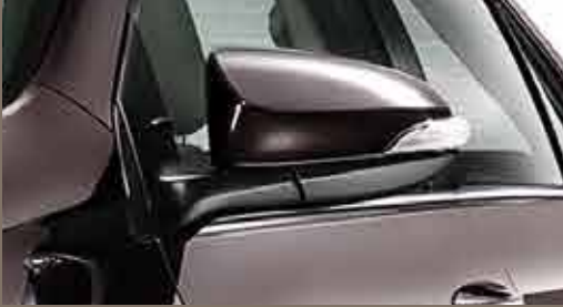
Reverse Linked and Auto Fold ORVM

Helps in cruising at a set speed effortlessly thus preventing driver fatigue