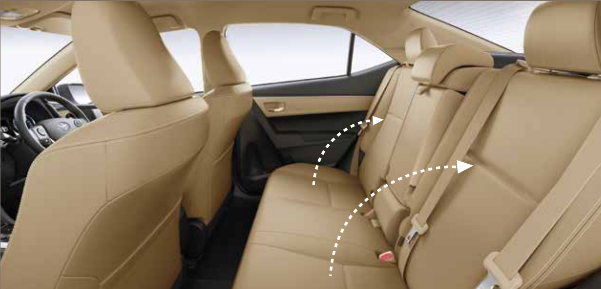
Opulent Rear Reclining Seats

With 5 recline angle options to smartly adjust the seat for a personalized level of comfort