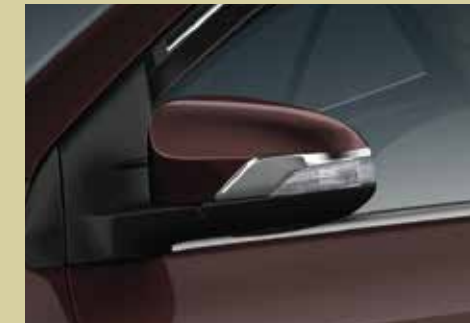
ORVM Chrome Garnish

Adorn your Corolla Altis with a range of alluring genuine Toyota accessories and enter into an esteemed world of style and prestige.