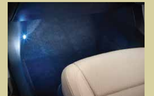
Leg Room Lamp (Blue) Also available in white LED