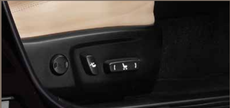
10 Way Adjustable Power Driver Seat with Lumbar Support

Enables to find the most comfortable seating position