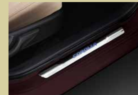
Illuminated Scuff Plate#