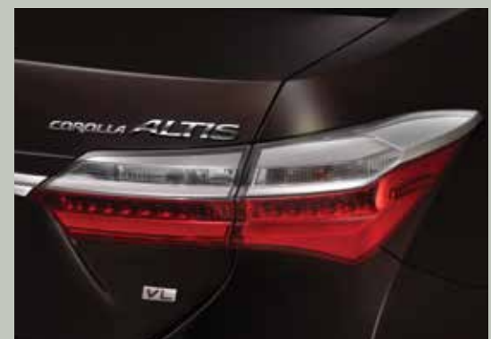
Stylish LED Tail Lamps

Provides enhanced illumination while consuming low power