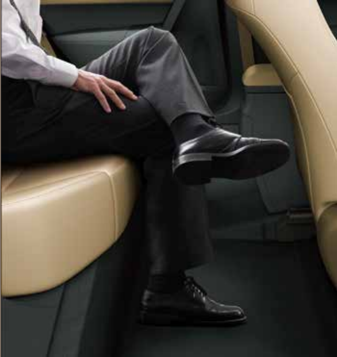
Ample Leg Room

Enables to find the most comfortable seating position