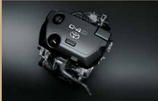
1.4L Diesel Engine with Variable Nozzle Turbo & Intercooler