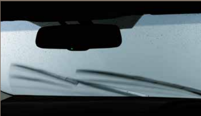
Rain Sensing Wipers

Ensures utmost comfort for rear passengers