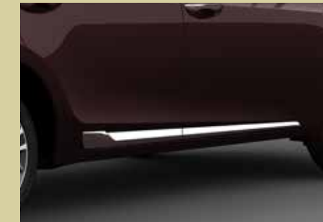
Chrome Side Protective Mould