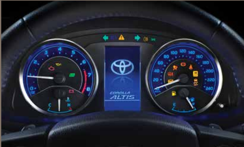
Colour MID with Optitron Meters

The Corolla Altis has always been at the zenith when it comes to overall cabin space and this time it is no different. With Ample Leg Room and Opulent Rear Reclining Seats, we have made sure that you have the most plush and comfortable experience. The Rear Sunshade and Centre Armrest with Cup Holders ensure everything you need is an arm's length away.