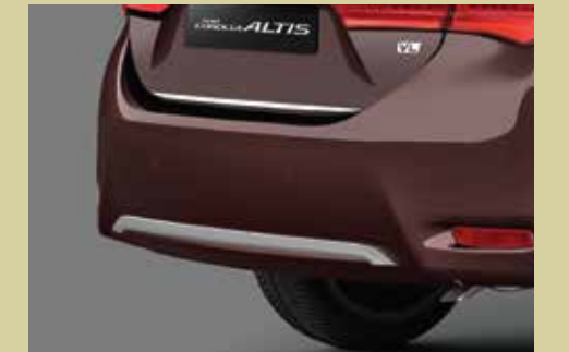
Back Sensor Also available in white & black colour options