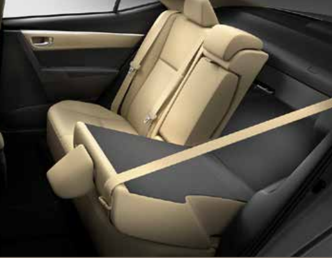
Rear Seat 60:40 Split

Comforts the cabin with refreshing air while leaving you with complete peace of mind