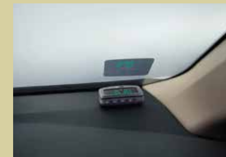
Head Up Display