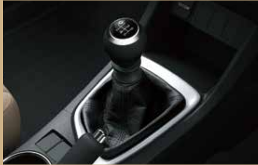
6-Speed Manual Transmission

BREAKING EVERY BARRIER. SURPASSING NEW BENCHMARKS.