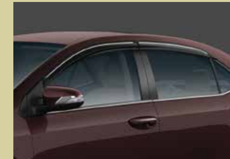
Side Visor With Chrome Garnish