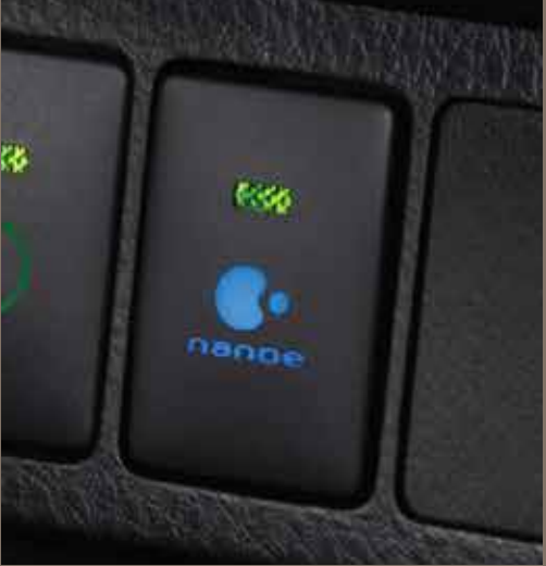
Minus Ion Generator (nanoe™)

Become automatically operational when they sense water droplets on the windscreen