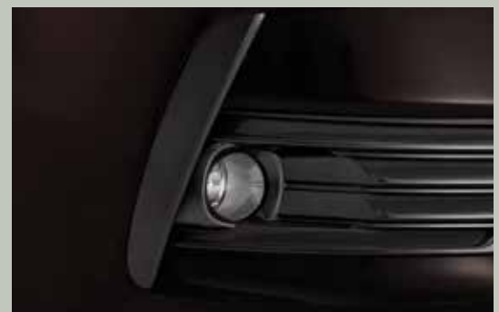
Smartly Integrated Fog Lamps

Renders a sharp sense of styling to the car