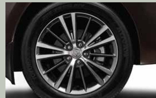
16.0 Alloy Wheels

Features a 3-Dimensional shaped outer lens that gives a wide and classy image