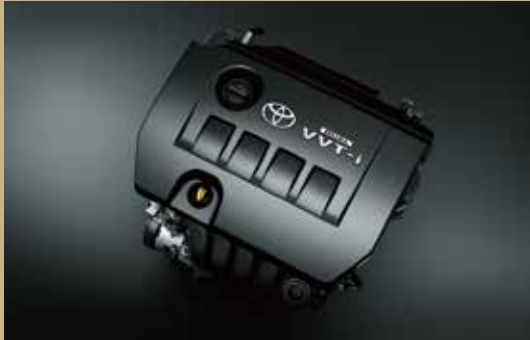
1.8L Dual VVT-i Gasoline Engine

The new Corolla Altis comes with 2 engine options - Gasoline and Diesel. Developed to deliver the best blend of power and efficiency, the contemporary engine technology ensures that you are always ahead of the curve.