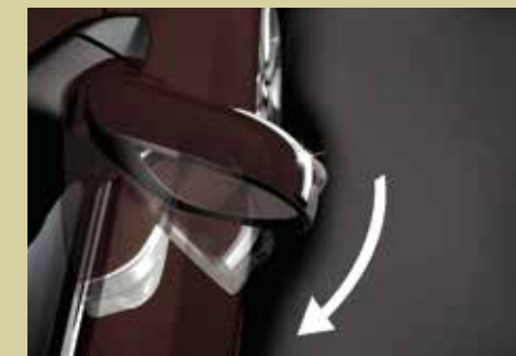
Auto Folding Side Mirror*