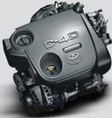
Powerful 1.4L Diesel Engine