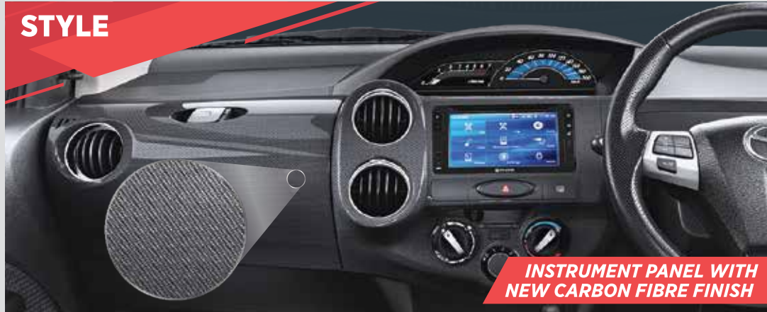
INSTRUMENT PANEL WITH NEW CARBON FIBRE FINISH