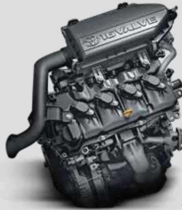
Refined 1.2L DOHC Petrol Engine