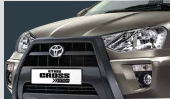
NEW BLACK FRONT GRILLE + FOG LAMP BEZELS

Leave a statement when you arrive. The new Cross is designed with a bold new front look and styled to make a bold entrance.