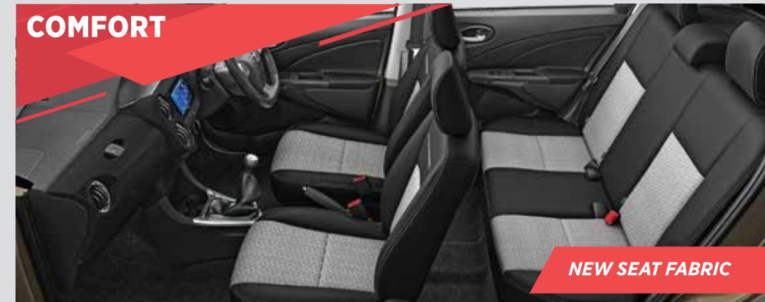
NEW SEAT FABRIC