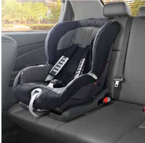
NEW ISOFIX CHILD SEAT LOCK* Meets international safety standards with a secure, easy-to-fix design for child safety. Available in all variants.