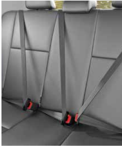
STANDARDIZED 3-POINT REAR SEAT BELTS With Emergency Locking Retractors (ELR) that instantly lock occupants safely during abrupt rapid braking.