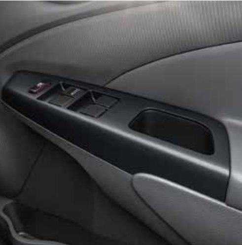
POWER WINDOWS ON DRIVER'S SIDE Enables effortless operation of all windows with a single touch.