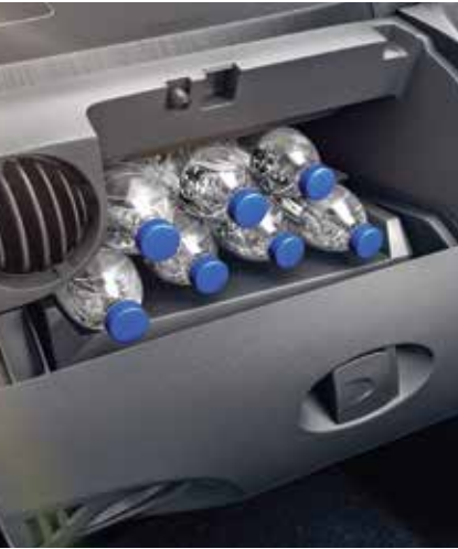
13l* COOLED GLOVE BOX An abundant 13l* space to store cool water for your customers.