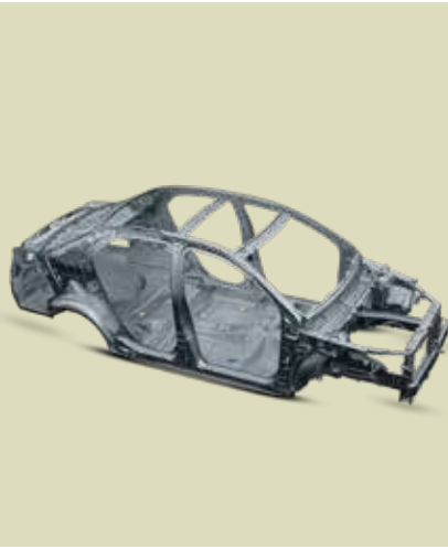
IMPACT ABSORBING BODY Distributes impact in case of collision for maximum protection.