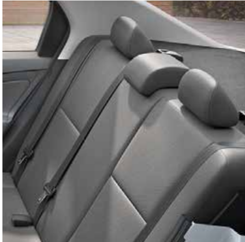
NEW REAR REMOVABLE HEADREST (ALL 3 SEATS) Designed to enhance comfort and reduce injuries in case of a collision. A standard feature across all variants.