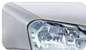
SILVER MICA METALLIC