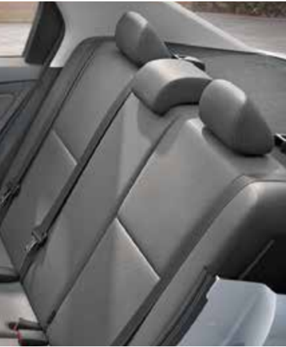
ERGONOMICALLY-DESIGNED REAR SEAT Contour-design and removable headrests assures complete comfort for passengers.