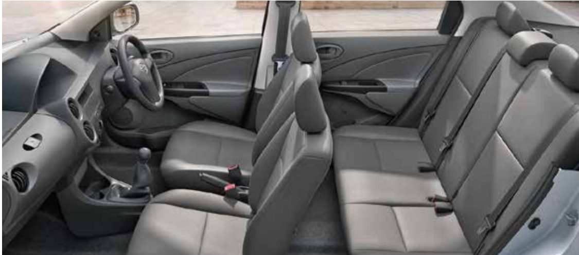
BEST-IN-CLASS CABIN SPACE Best-in-class head, shoulder and knee room ensure the most comfortable journey for all occupants, even for long durations.

The Toyota Etios is thoughtfully designed with ample space, as well as intelligent features to ensure complete comfort for you and your customers, no matter the length of the journey.