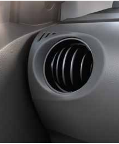
BEST-IN-CLASS AC WITH MULTIDIRECTIONAL VENTS Ensures the fastest, most effective cooling with 360° unique rotating function.