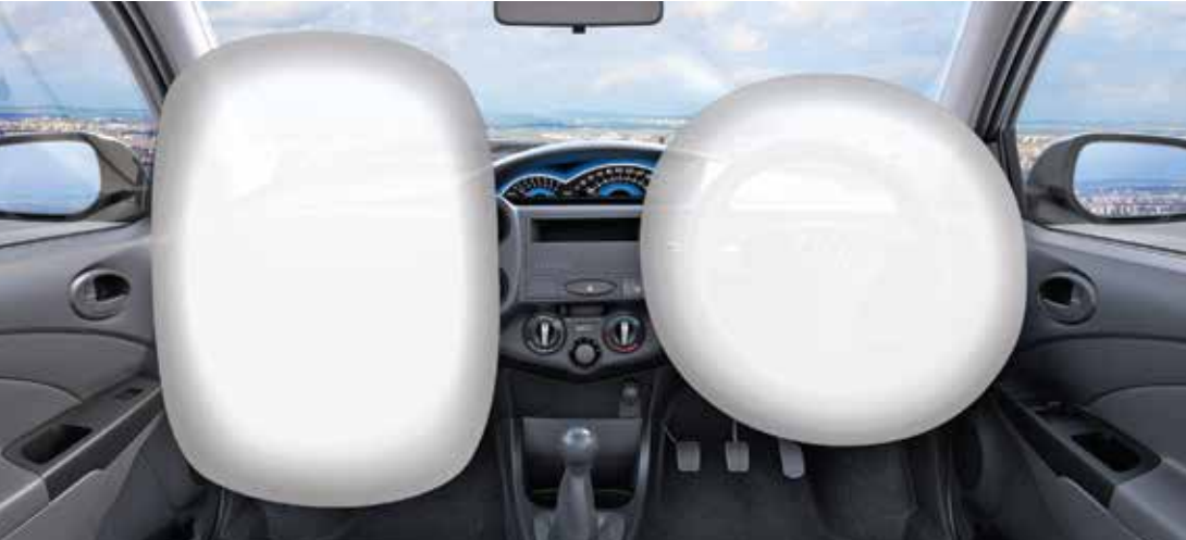
STANDARDIZED DUAL FRONT SRS AIRBAGS** Highly effective airbags that significantly reduce the impact of a collision for both driver and front passenger. A standard feature across all variants.

The Toyota Etios is equipped with a host of safety features so your customers can depend on you for safe and sound trips. And best of all, these world-class safety features are available as a standard across all variants.