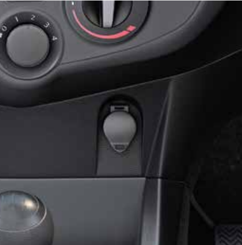
12V ACCESSORY SOCKET Makes on-the-go charging of mobile phones and laptops easier for driver and customers.