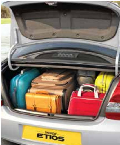
BEST-IN-CLASS 595l* BOOT SPACE Accommodates more luggage of all shapes and sizes. Makes loading and unloading easier with lower loading height.