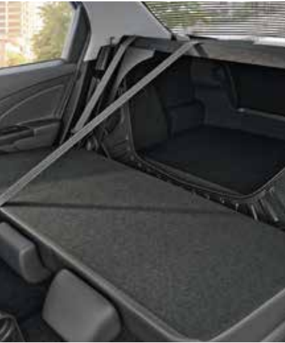
FOLDABLE REAR-SEAT Creates an open area from the trunk to the passenger compartment for increased cargo-versatility.