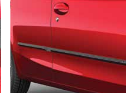
SIDE PROTECTION MOULD