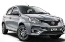
SILVER MICA METALLIC