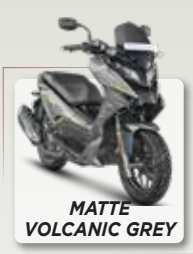
MATTE VOLCANIC GREY

^Based on the testing report of Govt. certified agency. Actual mileage may vary as per riding conditions.