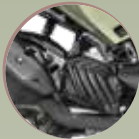
LIQUID COOLED ENGINE WITH 4 VALVE SINGLE CYLINDER SOHC