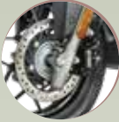
FRONT DISC BRAKE WITH ABS