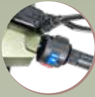
i3s SILENT START TECHNOLOGY