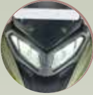
LED POSITION LAMP