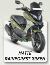
MATTE RAINFOREST GREEN