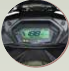
DIGITAL SPEEDOMETER WITH TURN-BY-TURN