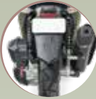
REAR DUAL SHOCK ABSORBERS