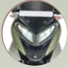
DUAL CHAMBER LED HEADLAMP