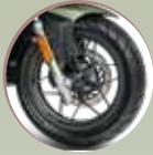
14 INCH LARGE WHEELS