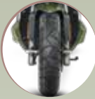
BLOCK PATTERN TYRES