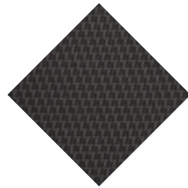
Swift Sport fabric

Available for Swift, Swift 4x4 and Swift Sport