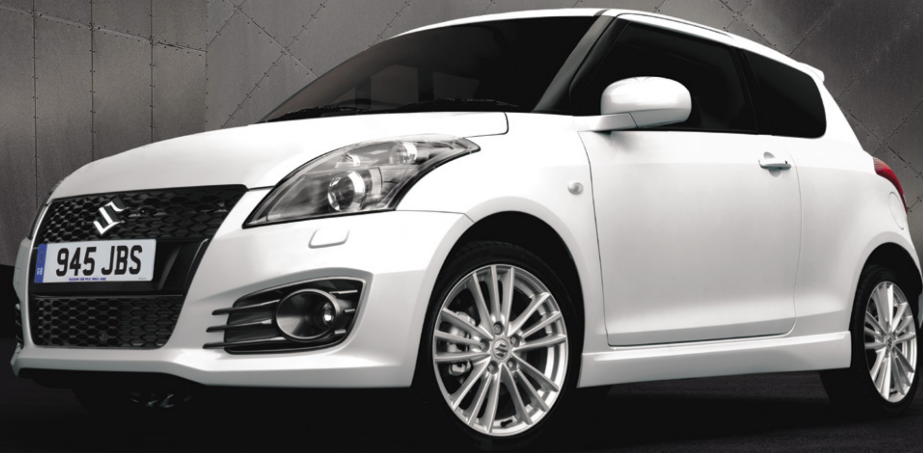
◆ High Intensity Discharge headlamps