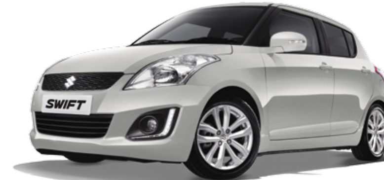
Silky Silver Metallic