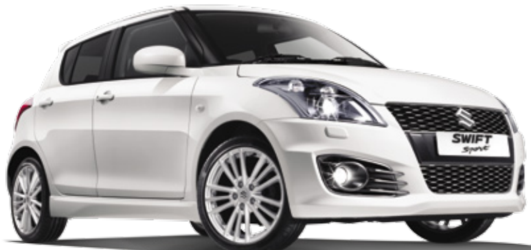
Cool White Pearl Metallic