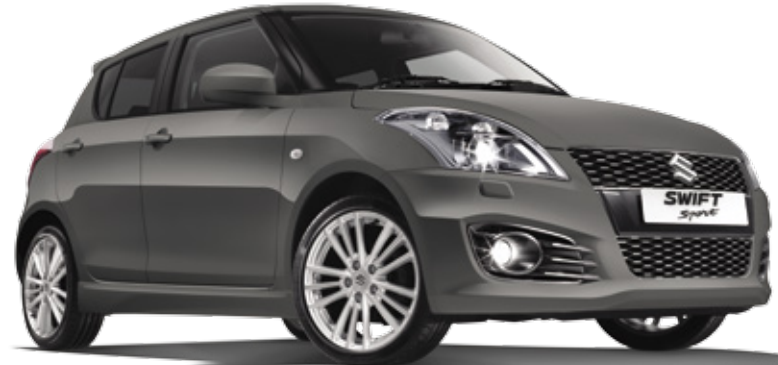
Galactic Grey Metallic