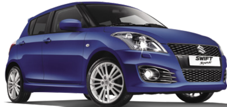
Boost Blue Pearl Metallic