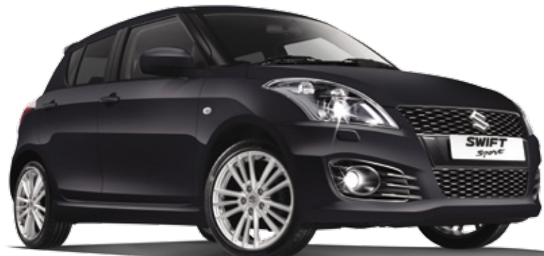
Cosmic Black Pearl Metallic