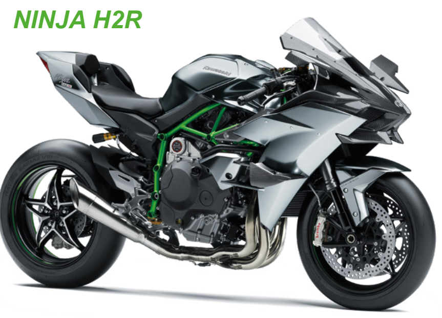
Mirror Coated Matte Spark Black

Pushing engineering and performance boundaries is one of the few motorcycles that truly deserve to be called Instant Icons. Created without compromise the Ninja H2R demands respect and attracts the most skilled and committed riders. This Vehicle is not manufactured for public road use.