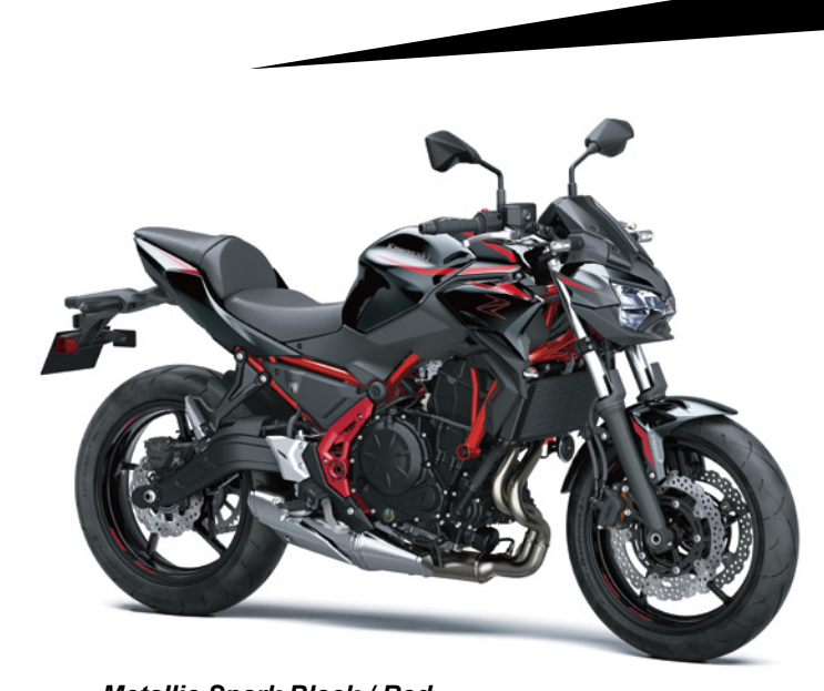
Metallic Spark Black / Red