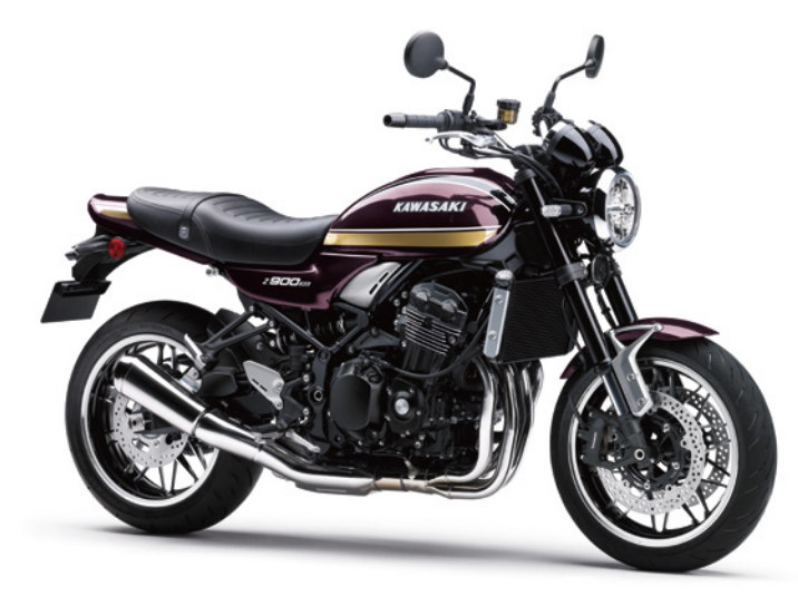
Candy Tone Red