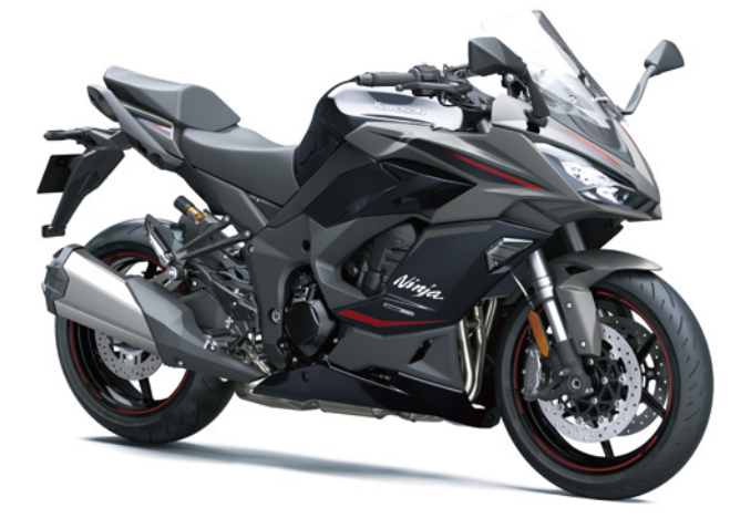
Metallic Matte Graphenesteel Gray / Metallic Diablo Black