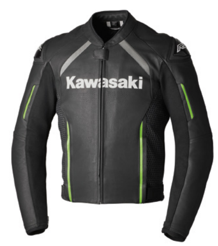
Rimini-2 Leather Jacket Man