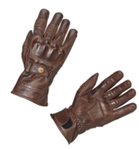
BRISTOL Leather glove Male