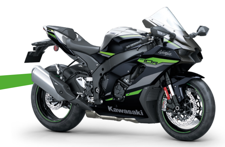
Metallic Graphite Gray / Metallic Diablo Black