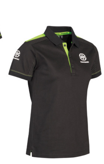
Sports Polo Lady