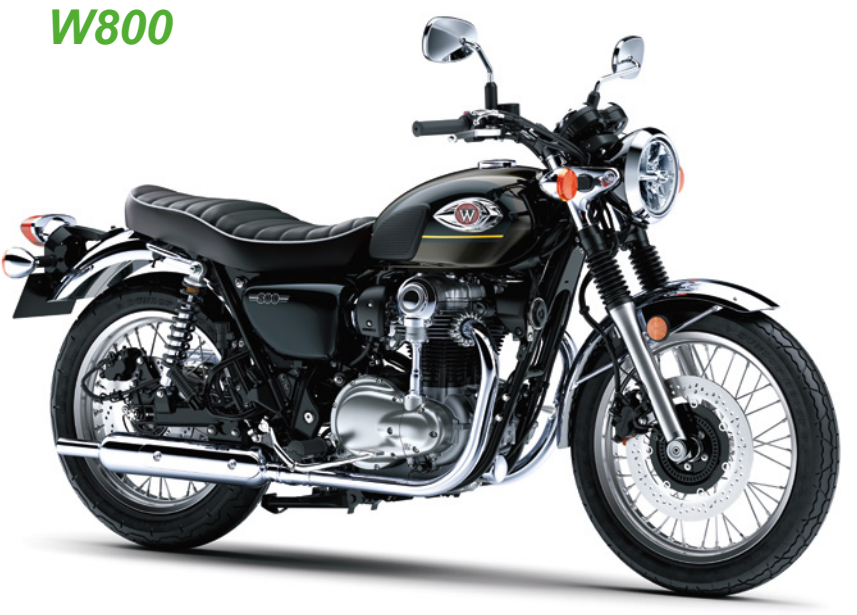
Metallic Brilliant Golden Black / Metallic Diablo Black

W800, the latest member of a fifty year Kawasaki W dynasty with an attention to detail andlevel of engineering craftsmanship that few machines possess. From the assured, easy handling to the evocative vintage ride appeal, W800 is the evolution of the authentic Original Icon, making yesterday alive today.