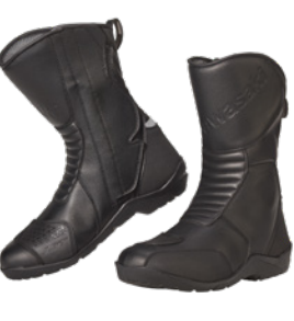
Rider boots Neuss