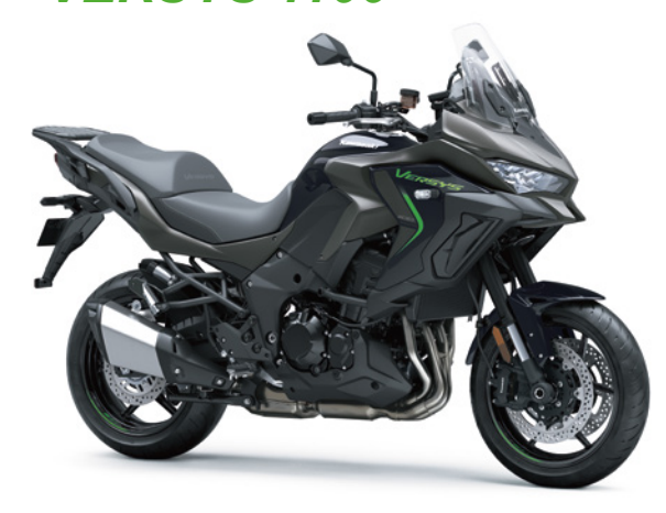
Metallic Matte Graphenesteel Gray / Metallic Diablo Black