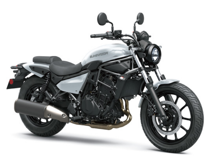
Pearl Robotic White