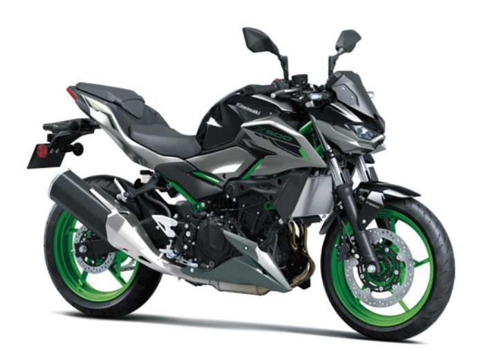
Metallic Moondust Gray / Metallic Spark Black