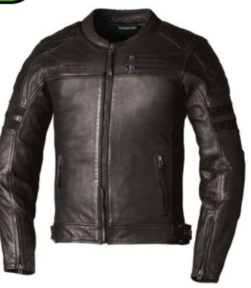
OXFORD Leather jacket Male