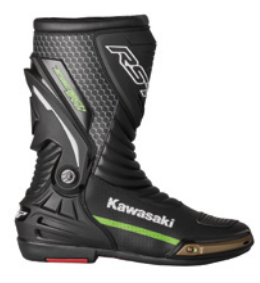
Turin-2 Boot Man