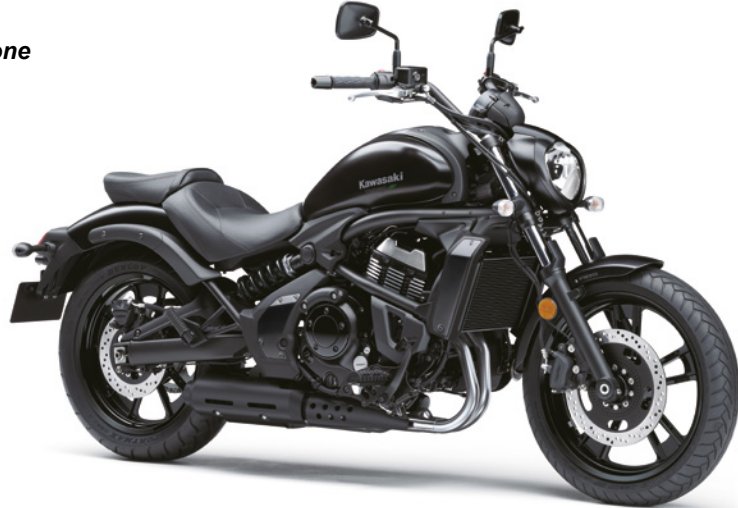
Metallic Flat Spark Black

Metallic Flat Spark Black / Metallic Flat Raw Graystone