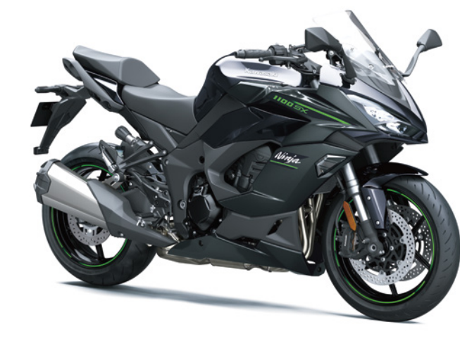
Metallic Carbon Gray / Metallic Diablo Black