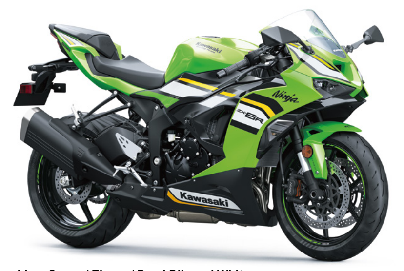
Lime Green / Ebony / Pearl Blizzard White