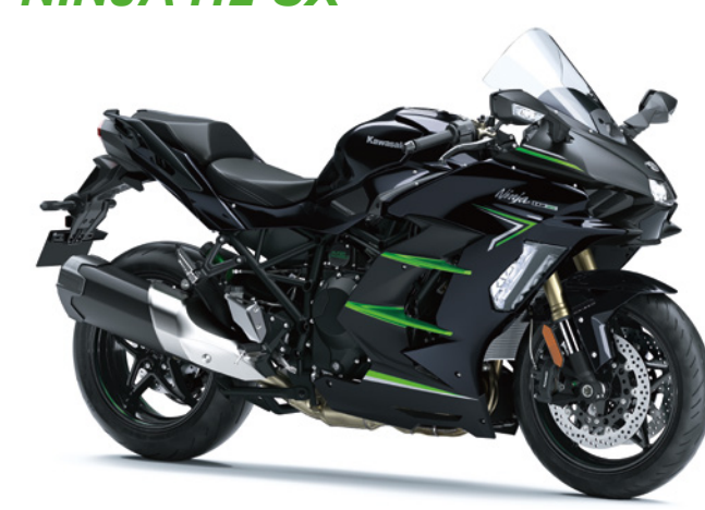
Metallic Diablo Black / Metallic Flat Spark Black