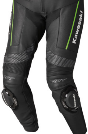
Padua-2 Leather Trousers Man