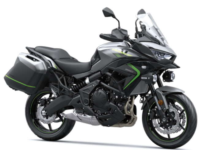
Metallic Matte Graphenesteel Gray / Metallic Spark Black Model shown is Versys 650 Tourer Plus edition