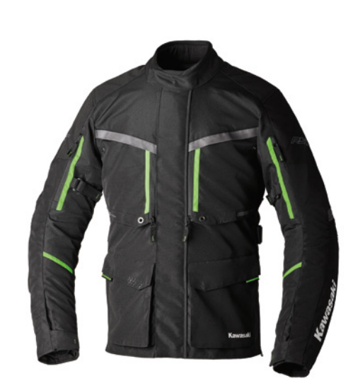
Trier-2 Touring Jacket Man