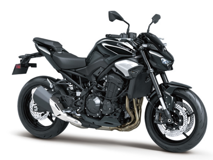
Metallic Spark Black / Metallic Carbon Gray / Ebony