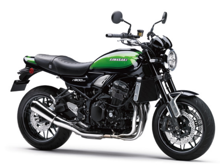
Metallic Diablo Black