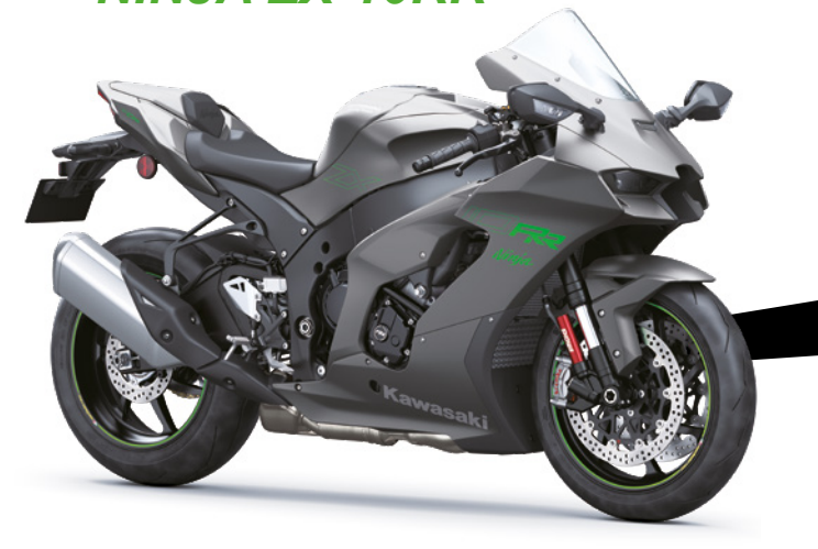
Metallic Matte Graphenesteel Gray