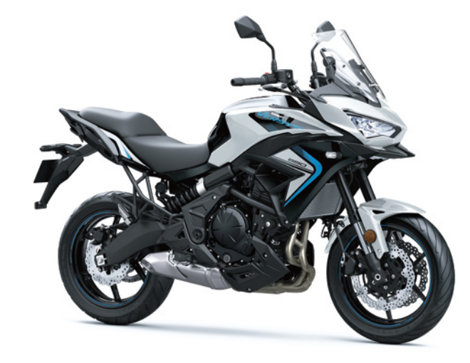
Pearl Robotic White / Metallic Spark Black