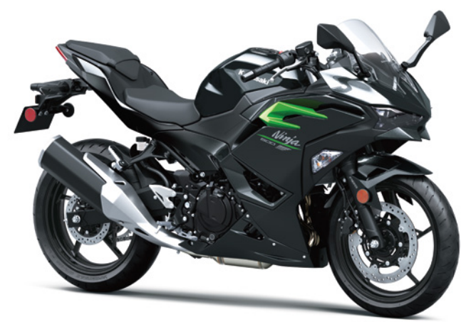
Metallic Carbon Gray / Candy Lime Green