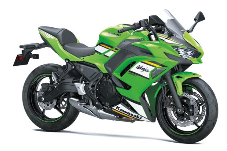
Lime Green / Ebony / Pearl Blizzard White