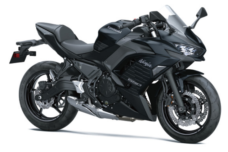
Metallic Matte Carbon Gray / Flat Ebony