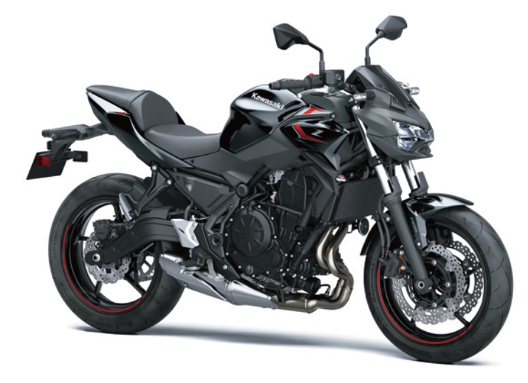
Metallic Matte Dark Gray / Metallic Spark Black