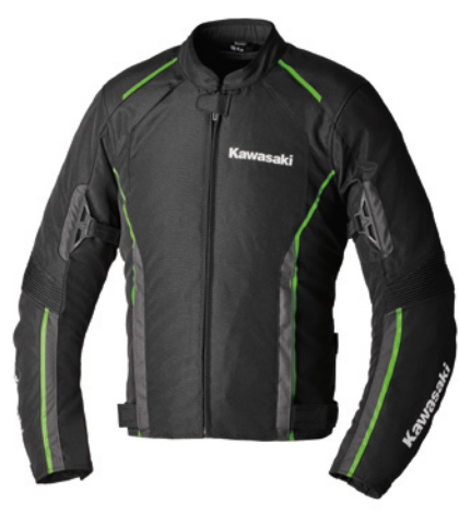
Amiens-2 Textile Jacket Man Dijon-2 Textile Glove Man