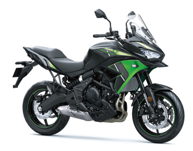
Metallic Flat Spark Black / Candy Lime Green