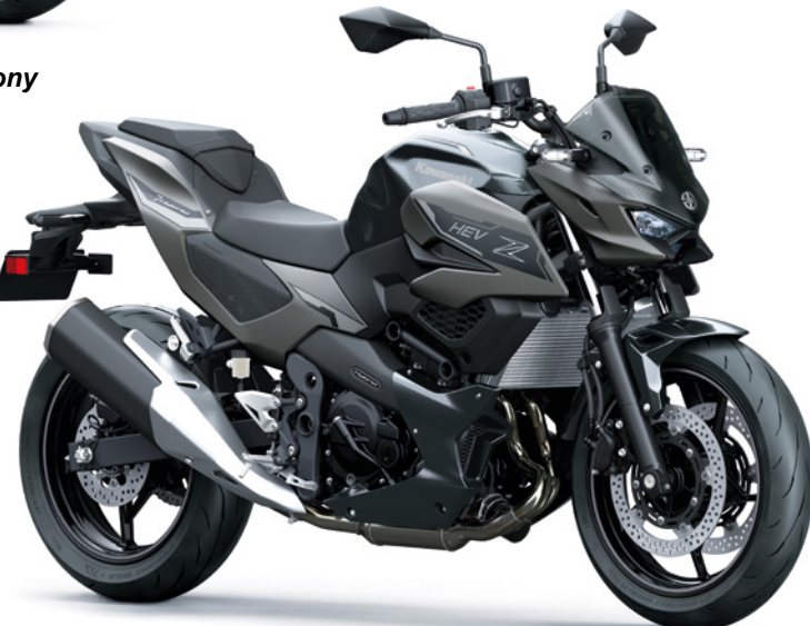
Metallic Matte Graphenesteel Gray / Ebony/Metallic Graphite Gray