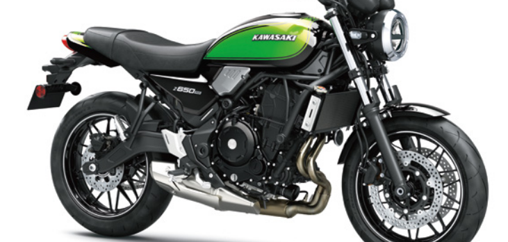
Ebony / Green