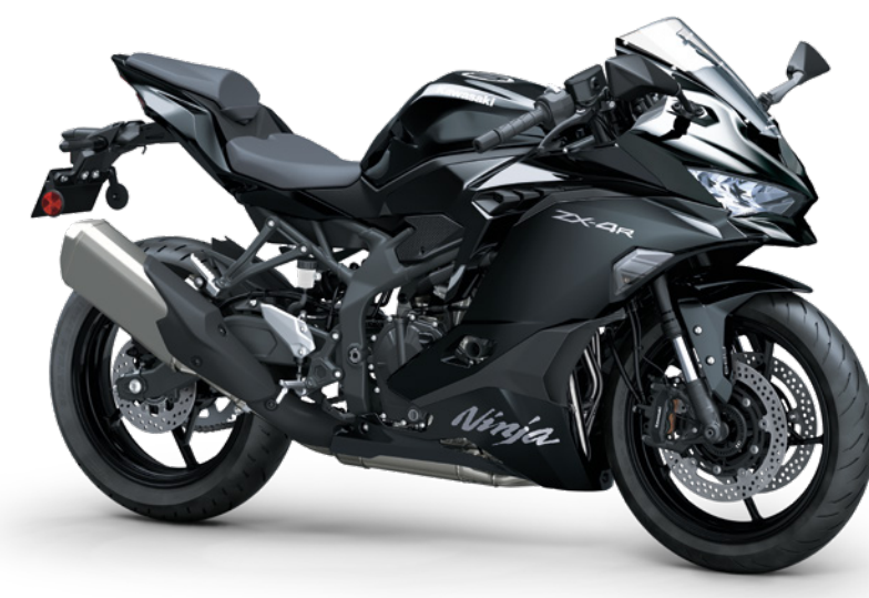
Metallic Spark Black