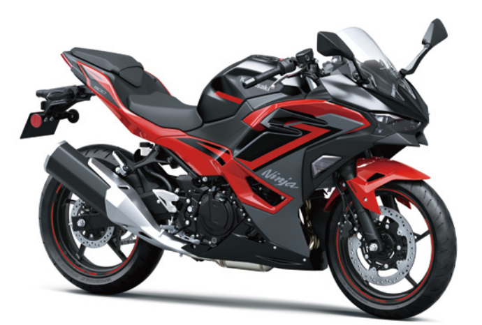
Passion Red / Metallic Flat Spark Black / Metallic Matte Dark Gray