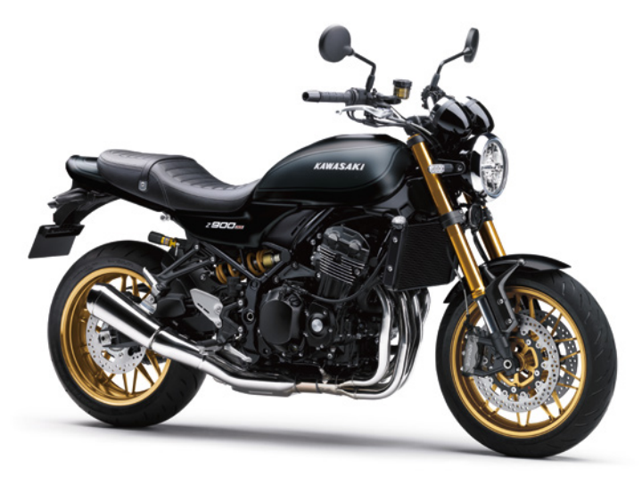
Metallic Flat Spark Black / Metallic Matte Carbon Gray