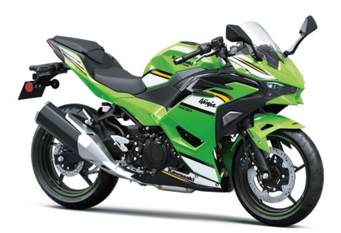
Lime Green / Ebony / Pearl Blizzard White