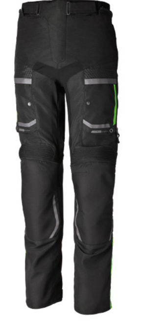
Bamberg-2 Touring Trousers Man