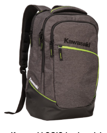
Kawasaki OGIO backpack bag