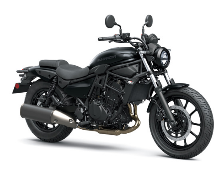
Metallic Flat Spark Black