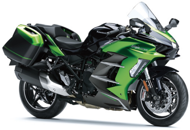
Emerald Blazed Green / Metallic Diablo Black / Metallic Matte Graphenesteel Gray

Model shown is Ninja H2 SX SE Tourer Edition