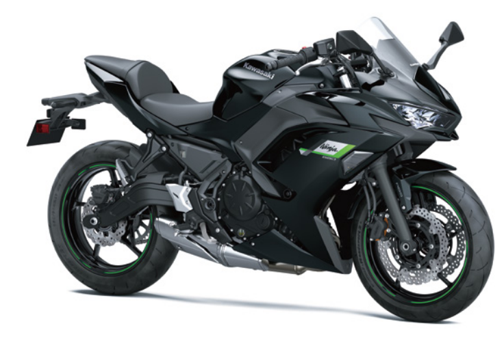
Metallic Spark Black / Metallic Flat Spark Black