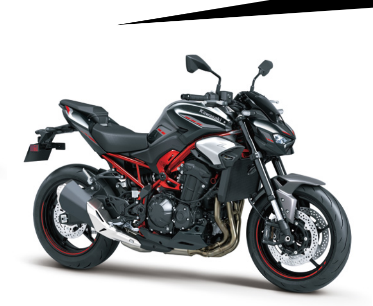
Metallic Carbon Gray / Metallic Phantom Silver / Candy Persimmon Red