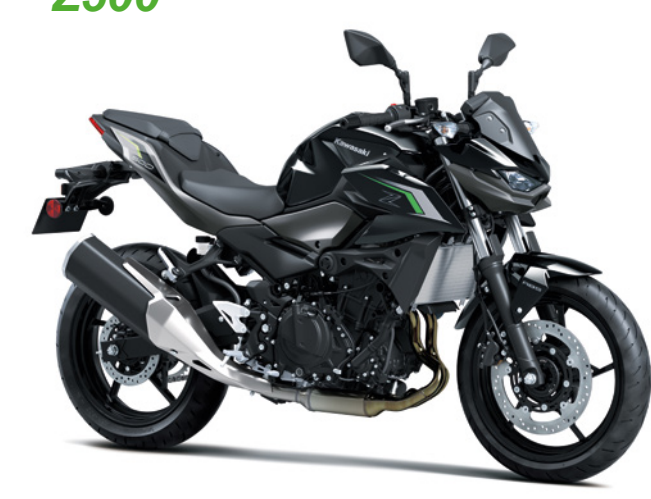
Metallic Spark Black / Metallic Matte Graphenesteel Gray