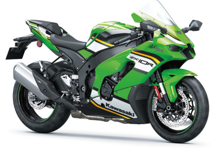
Lime Green / Ebony / Pearl Blizzard White