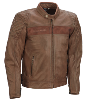
LONDON Brown Leather jacket Male