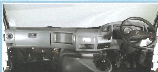
Smart Dashboard, Convenient Controls