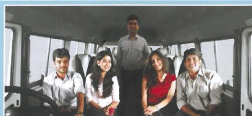
2x2 Seating (26 Seater)