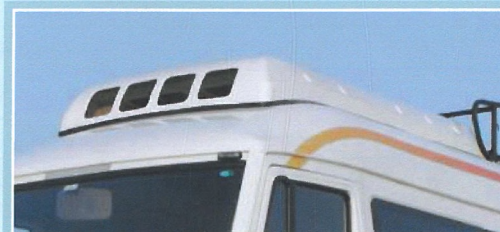
Roof top AC option available