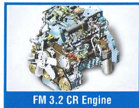
FM 3.2 CR Engine