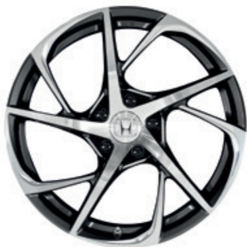
EXCLUSIVE INTERWOVEN WHEEL - MACHINED