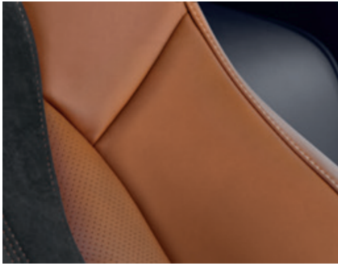
SADDLE: SEMI-ANILINE LEATHER & ALCANTARA HEATED POWER SPORT SEATS