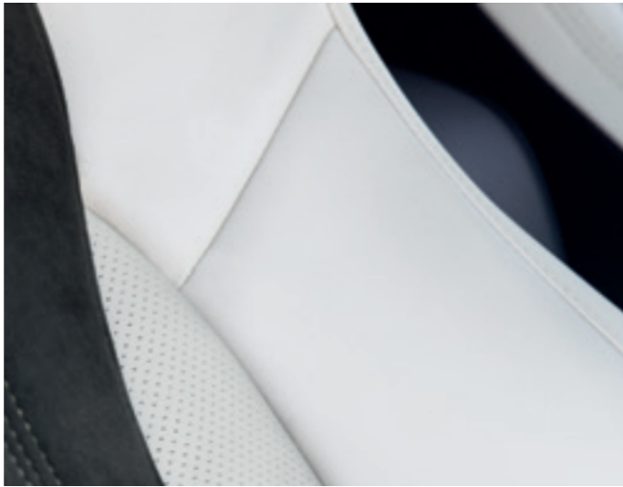
ORCHID: SEMI-ANILINE LEATHER & ALCANTARA HEATED POWER SPORT SEATS