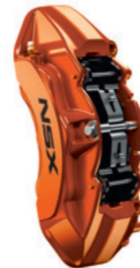
ORANGE BRAKE CALLIPERS