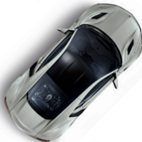
CASINO WHITE PEARL