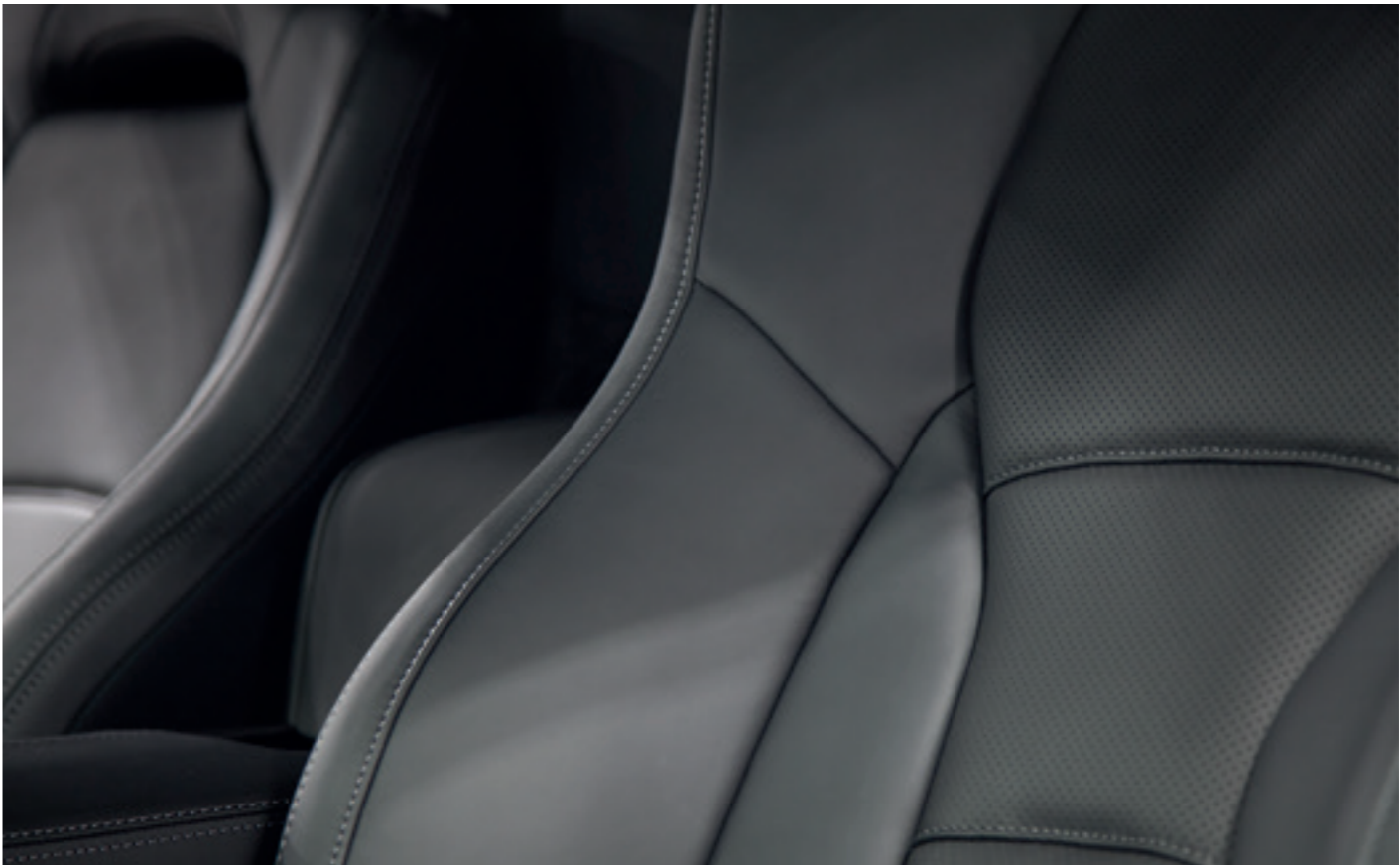
EBONY: SEMI-ANILINE FULL LEATHER HEATED POWER SPORT SEATS