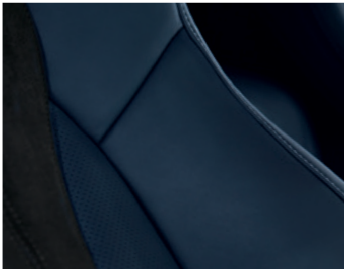
BLUE: SEMI-ANILINE LEATHER & ALCANTARA HEATED POWER SPORT SEATS