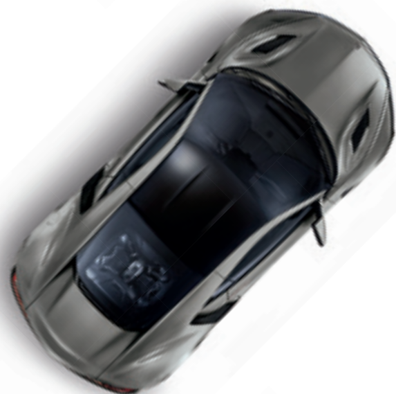
SOURCE SILVER METALLIC