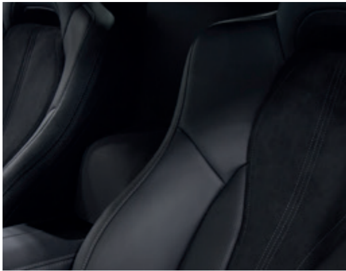
EBONY: MILANO LEATHER & ALCANTARA MANUAL SPORT SEATS