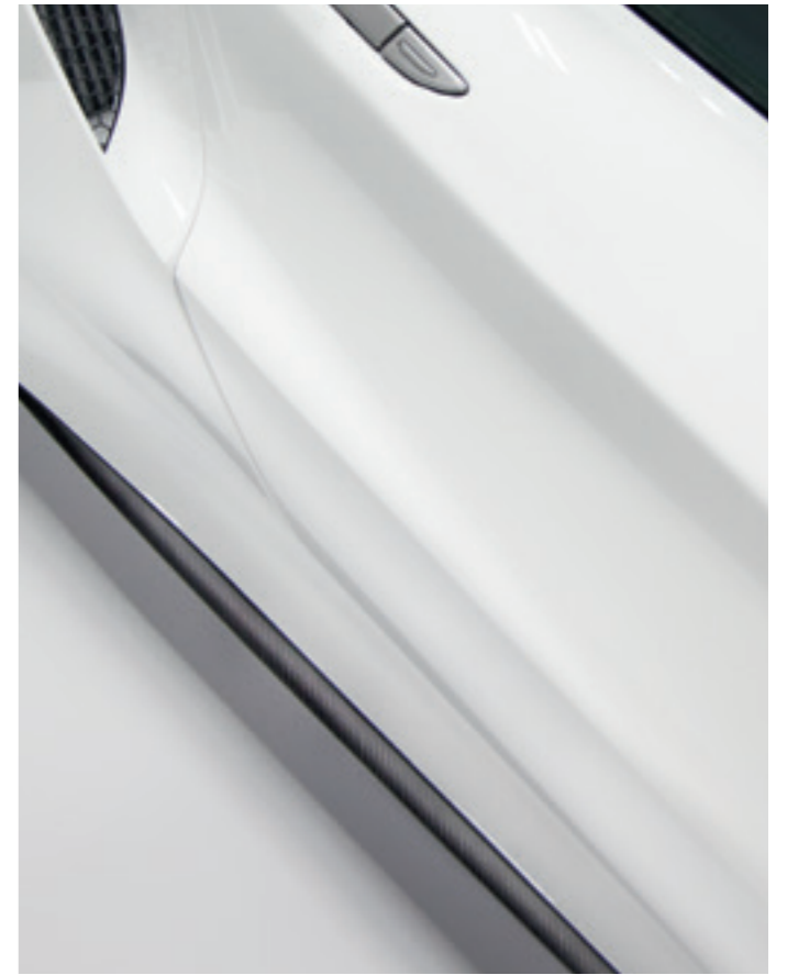
CARBON FIBRE SIDE SILL