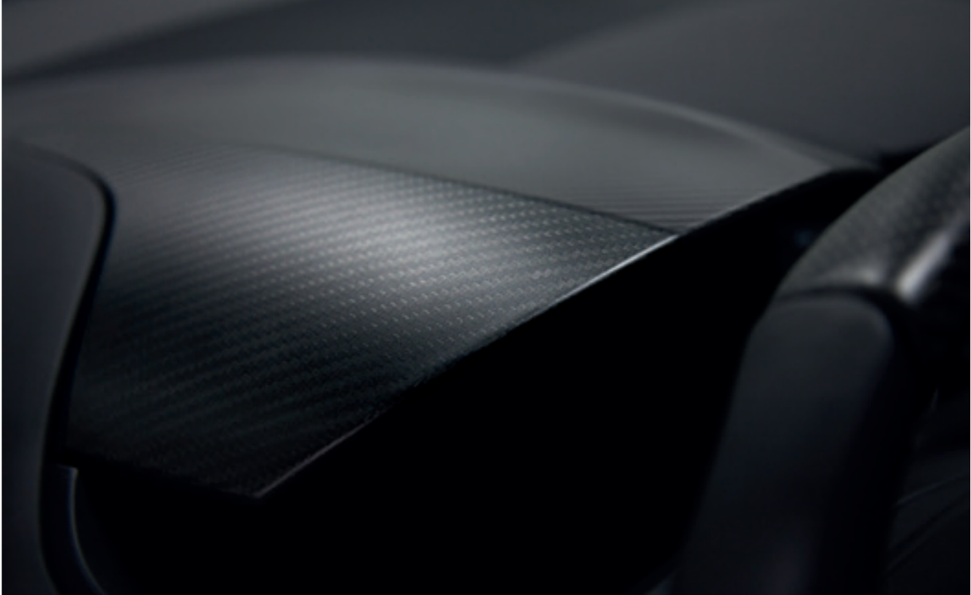
CARBON FIBRE METER VISOR