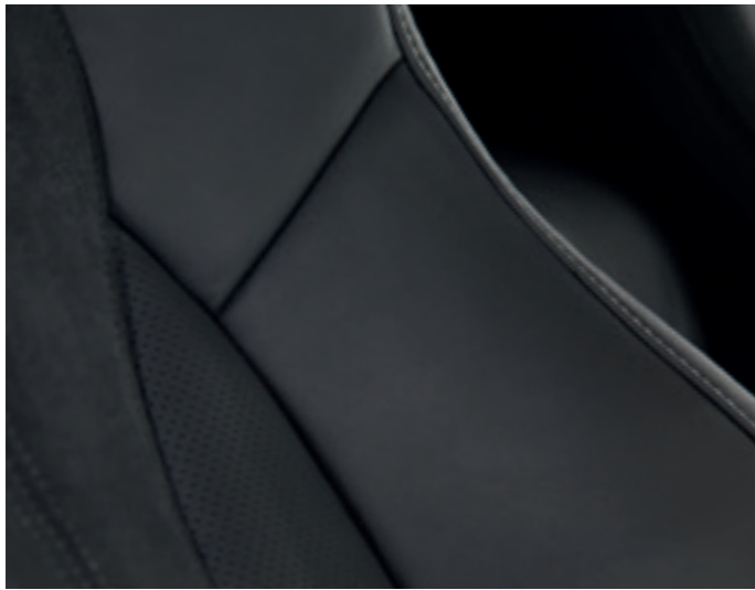
EBONY: SEMI-ANILINE LEATHER & ALCANTARA HEATED POWER SPORT SEATS