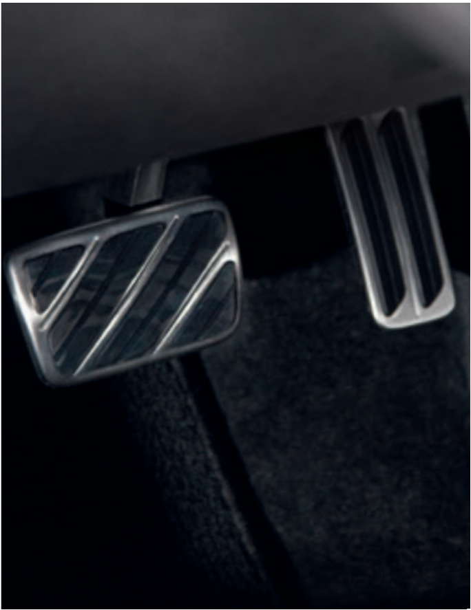
ALUMINIUM SPORT PEDALS