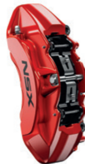
RED BRAKE CALLIPERS