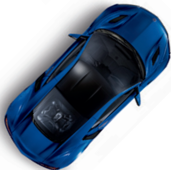
NOUVELLE BLUE PEARL