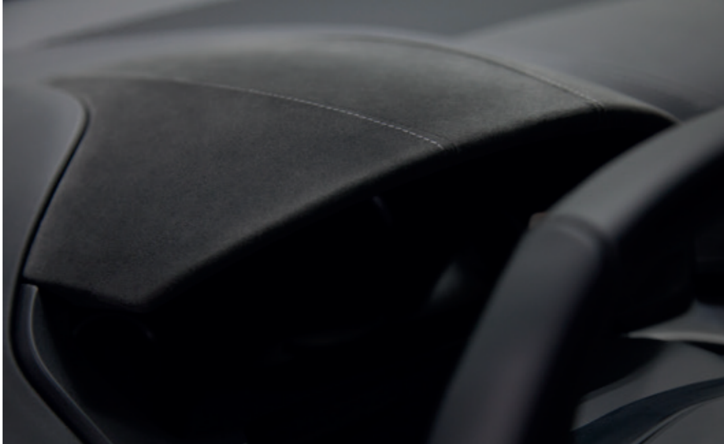
ALCANTARA METER VISOR