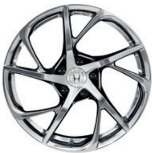
EXCLUSIVE INTERWOVEN WHEEL - POLISHED