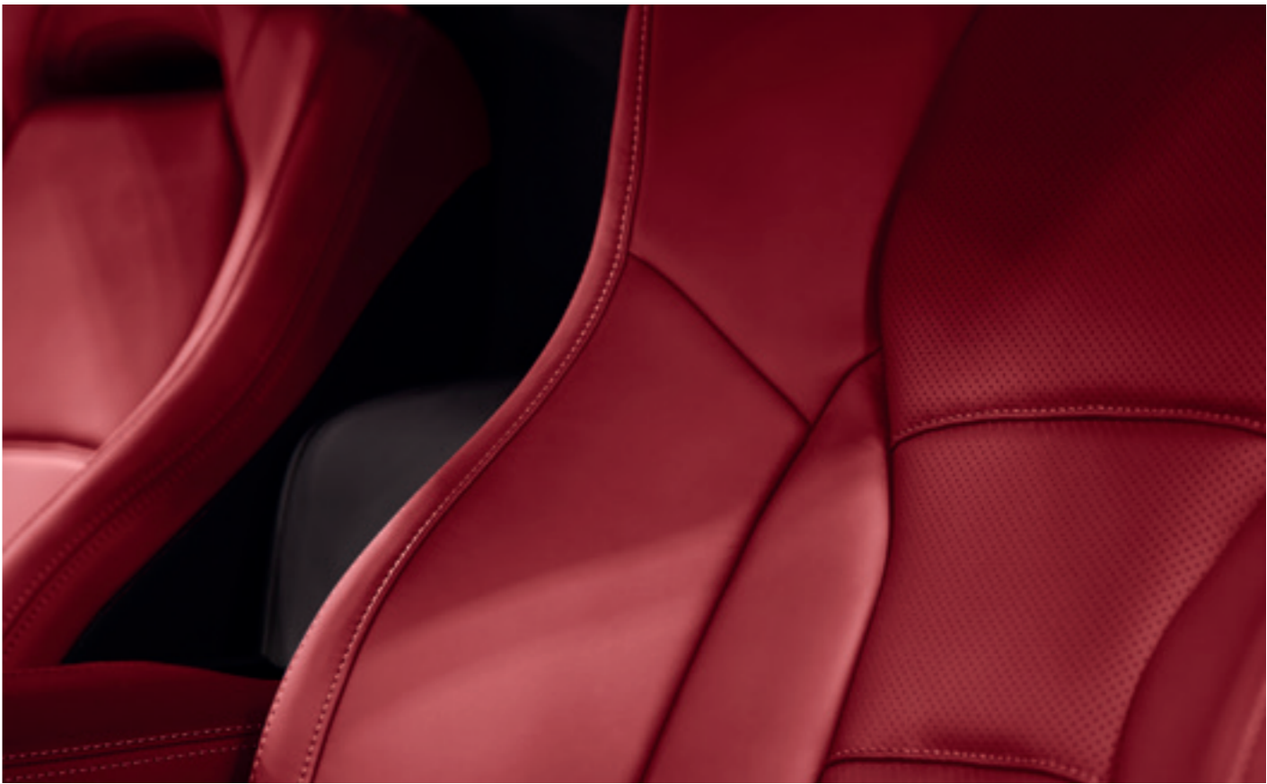
RED: SEMI-ANILINE FULL LEATHER HEATED POWER SPORT SEATS