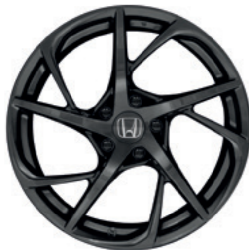
EXCLUSIVE INTERWOVEN WHEEL - PAINTED