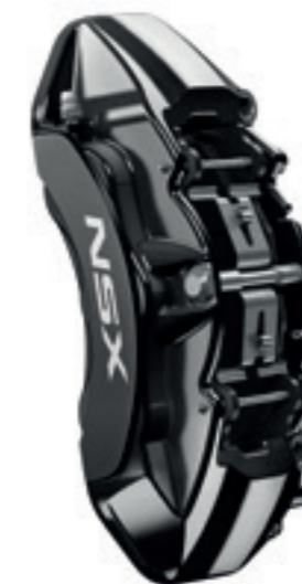
BLACK BRAKE CALLIPERS