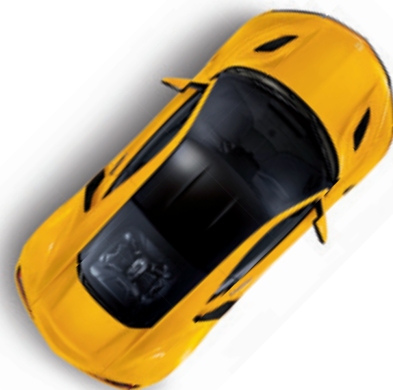
INDIE YELLOW PEARL II