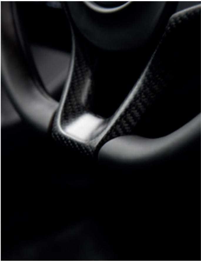
CARBON FIBRE STEERING WHEEL GARNISH