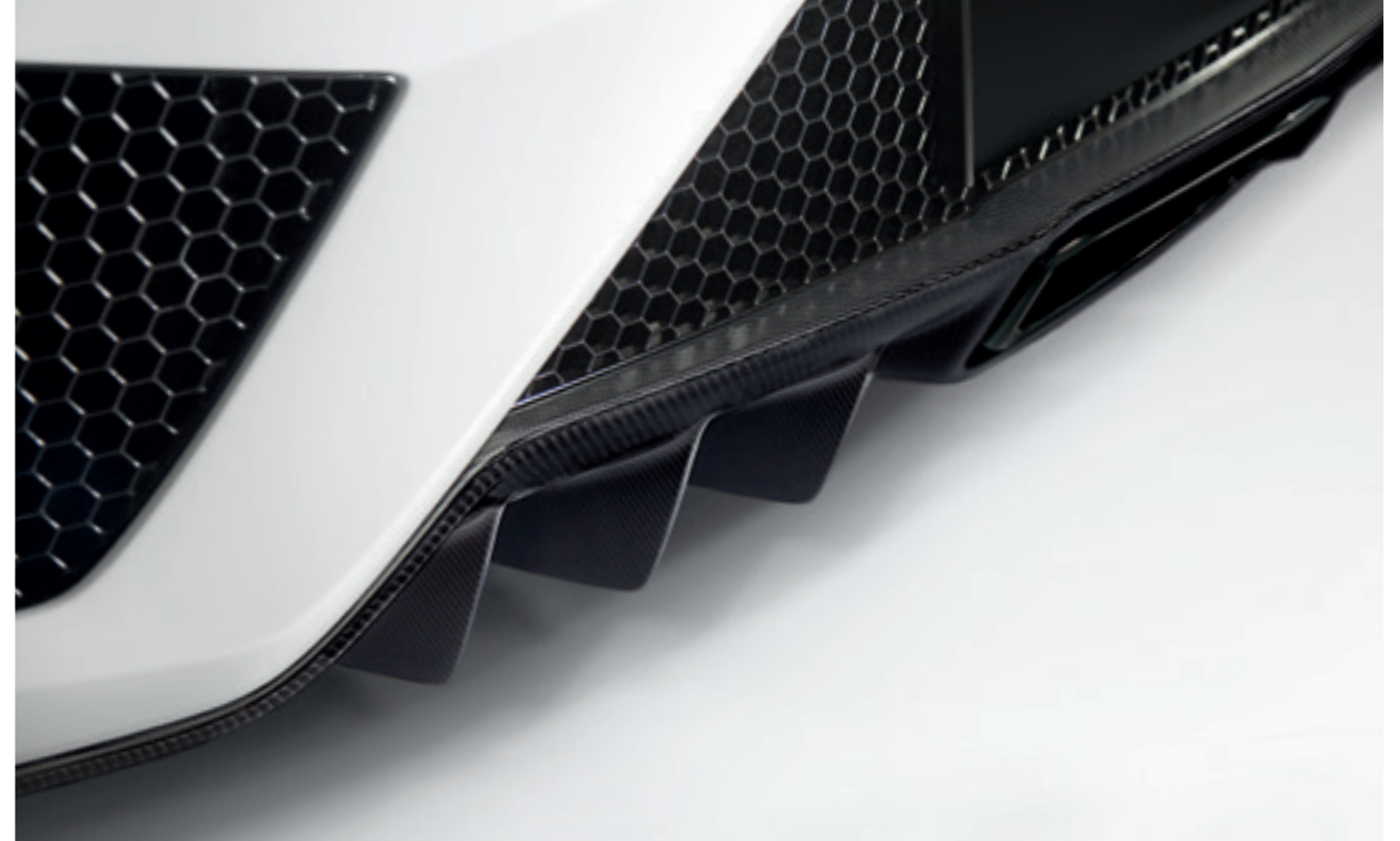
CARBON FIBRE REAR DIFFUSER & DARK CHROME EXHAUST FINISHER