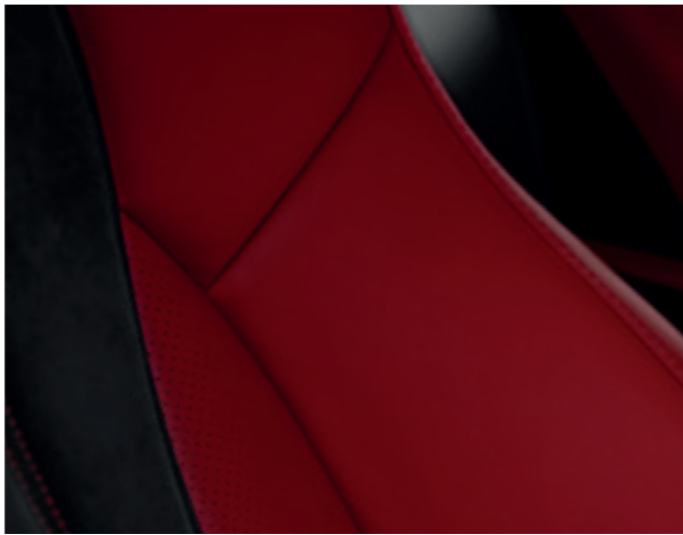
RED: SEMI-ANILINE LEATHER & ALCANTARA HEATED POWER SPORT SEATS