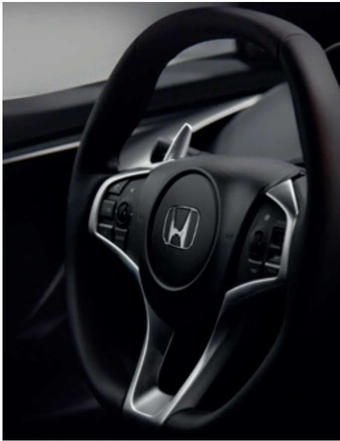
LEATHER-WRAPPED STEERING WHEEL