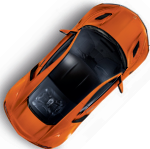
THERMAL ORANGE PEARL