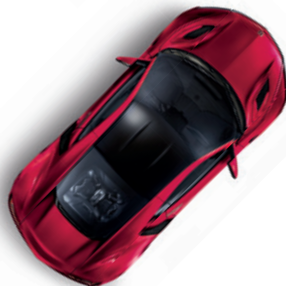
VALENCIA RED PEARL