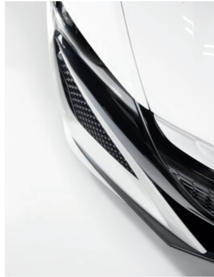
CARBON FIBRE FRONT SPOILER