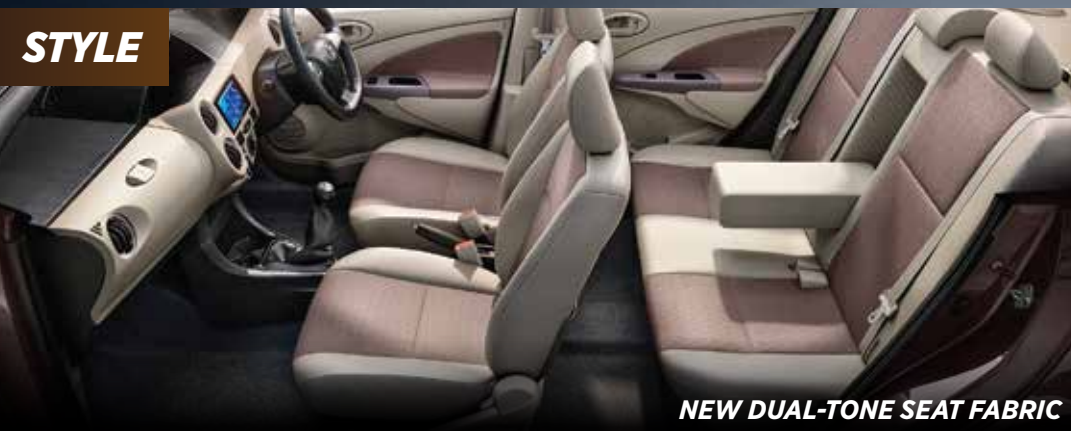
NEW DUAL-TONE SEAT FABRIC