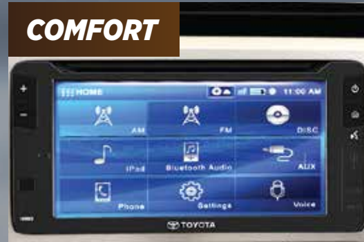
NEW 6.8 TOUCHSCREEN AUDIO