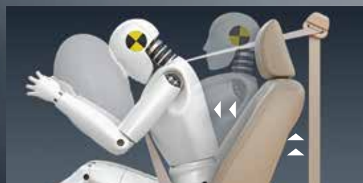
FRONT SEAT BELT WITH PRE-TENSIONER & FORCE LIMITER