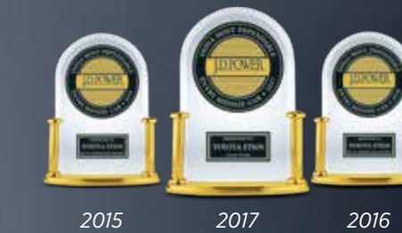
3 YEARS IN A ROW

THE TOYOTA ETIOS RANKED MOST DEPENDABLE ENTRY MID-SIZE CAR IN THE J.D. POWER 2017 INDIA VEHICLE DEPENDABILITY STUDY † .