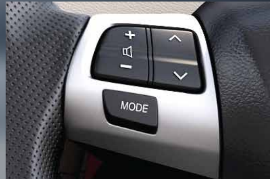
STEERING-MOUNTED AUDIO CONTROLS