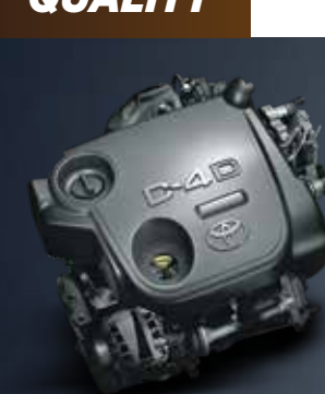
POWERFUL 1.4l DIESEL ENGINE