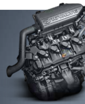
REFINED 1.5l DOHC PETROL ENGINE