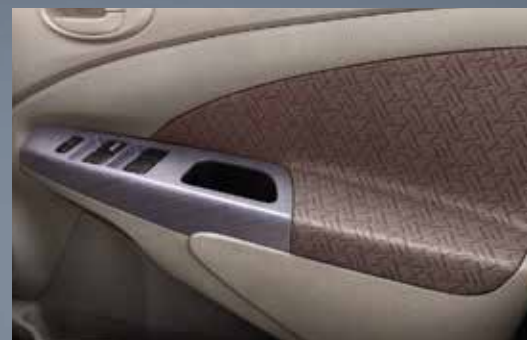
DOOR TRIMS WITH NEW BROWN FABRIC AND DOOR ARMREST WITH NEW BROWN CROSS MESH FINISH