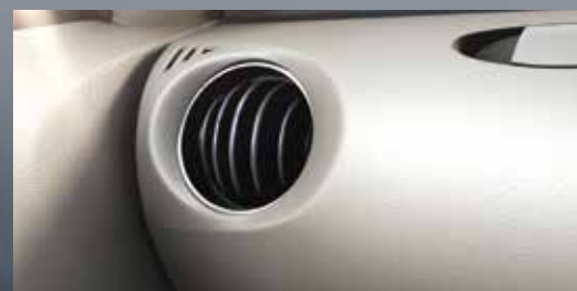
BEST-IN-CLASS AC WITH MULTIDIRECTIONAL VENTS