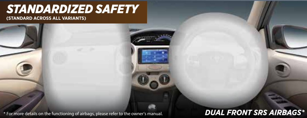
DUAL FRONT SRS AIRBAGS*

* For more details on the functioning of airbags, please refer to the owner's manual.