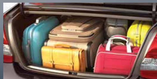
BEST-IN-CLASS 592l # BOOT SPACE