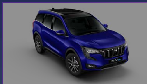
DUAL TONE BLACK ROOF