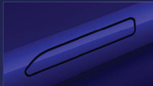
SMART DOOR HANDLES