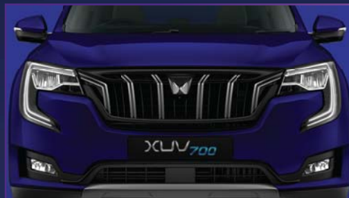
STRIKING CLEAR-VIEW LED HEADLAMPS WITH DRL AND SEQUENTIAL TURN INDICATOR