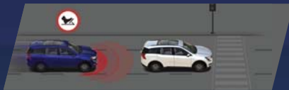
AUTOMATIC EMERGENCY BRAKING