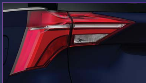
CAPTIVATING ARROW-HEAD LED TAILLAMPS