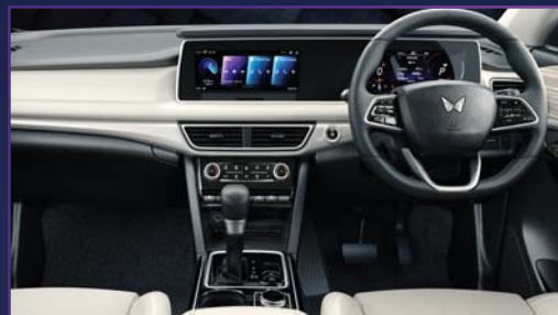
LUXURIOUS AND SOPHISTICATED INTERIORS

The Adrenox powered XUV700 is effortlessly impressive. From the style lines to the bold SUV stance, just one look is enough to get heads turning. Add the Skyroof™ and distinct LED cabin lights, and you've got an SUV that can't be ignored.