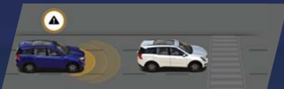
FORWARD COLLISION WARNING