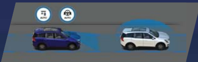
SMART PILOT ASSIST

HERE'S HOW ADAS PROTECTS YOUR XUV700 ON EVERY DRIVE: