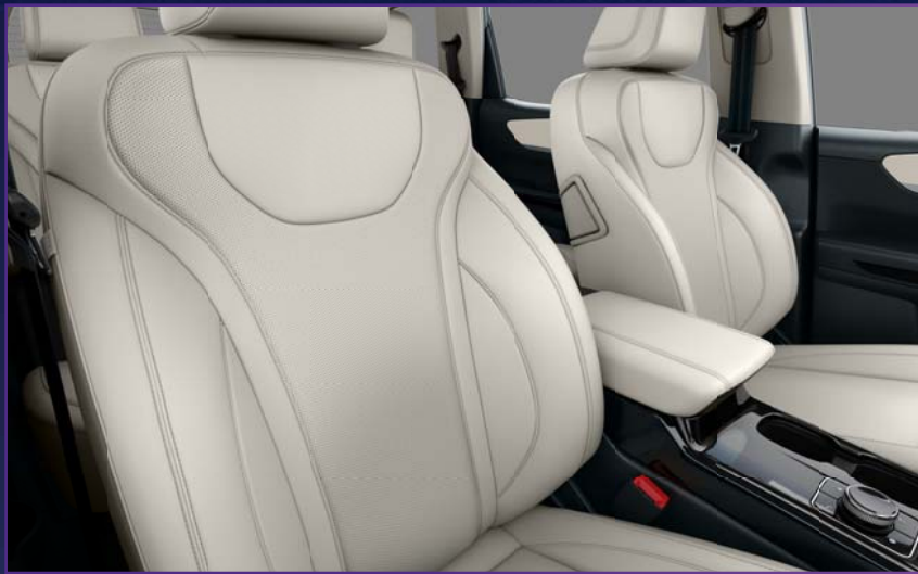
ALL-NEW FRONT VENTILATED SEATS