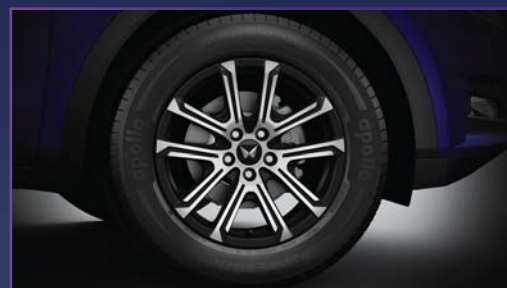
R18 DIAMOND-CUT ALLOY WHEELS