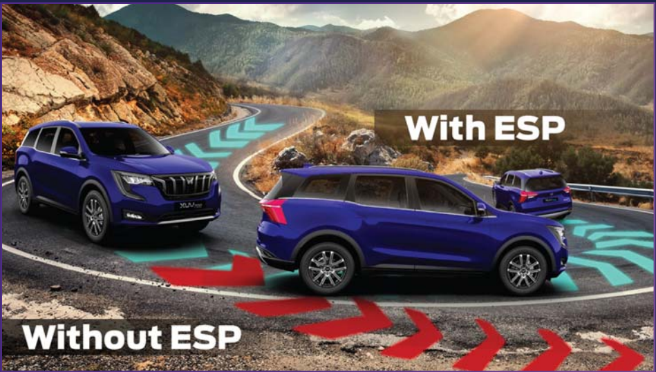
LATEST-GEN ELECTRONIC STABILITY PROGRAM

DRIVER DROWSINESS DETECTION • AUTO BOOSTER HEADLAMPS PERSONALIZED SAFETY ALERTS • ELECTRONIC PARK BRAKE