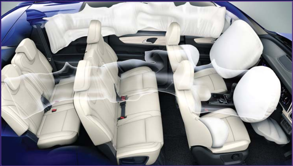
BEST-IN-CLASS 7 AIRBAG SAFETY