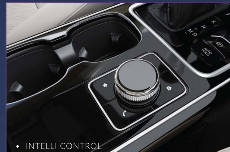
• INTELLI CONTROL

Developed in partnership with SONY Corporation, Japan, this immersive first-in-segment 12 speaker and 3D sound system is designed to take your listening experience to a whole new level.